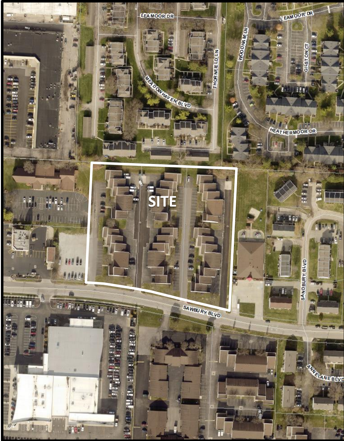
CV22-082 2686-2772 Sawbury Blvd. Approximately 3.97 acres