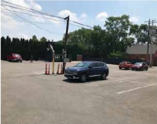
EXISTING PARKING LOT / PLAY SPACE