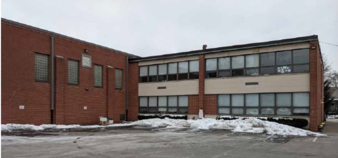
REAR OF MAIN CLASSROOM BUILDING