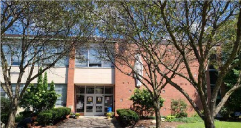
MAIN CLASSROOM BUILDING