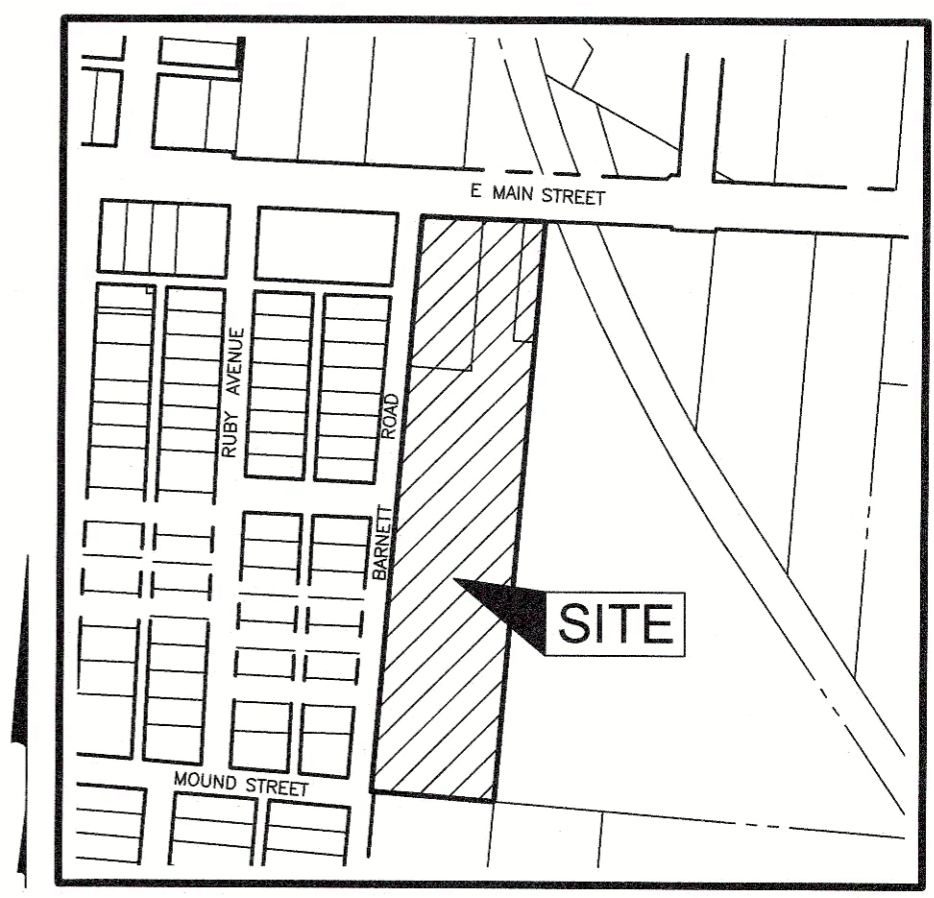
LOCATION MAP AND BACKGROUND DRAWING NOT TO SCALE