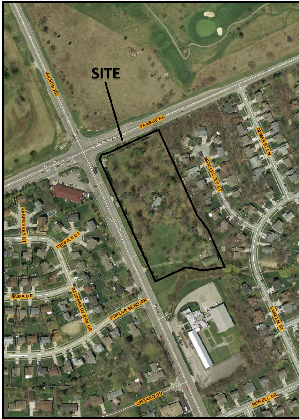
CV16-041 1648 North Wilson Road Approximately 5.62 acres