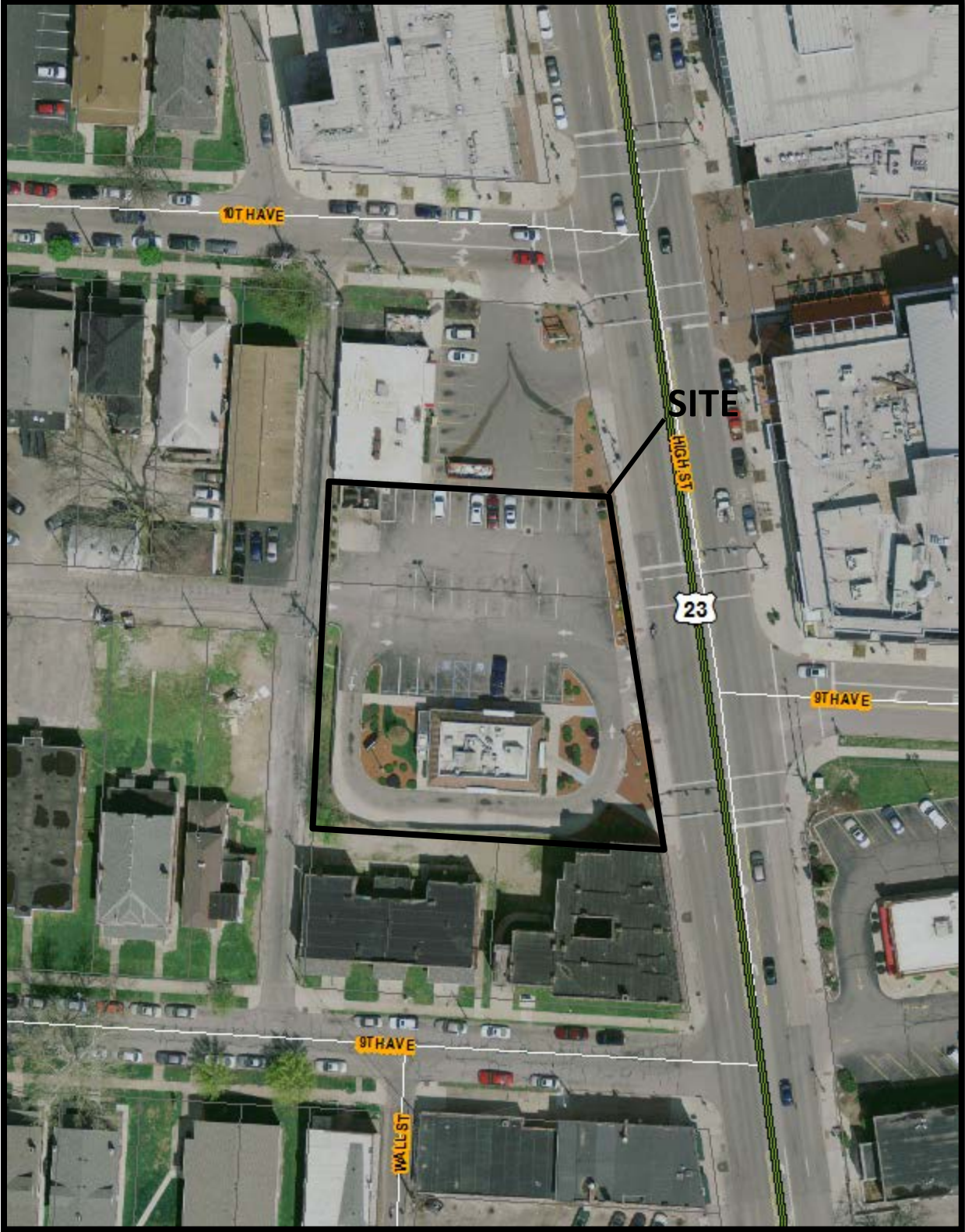
CV15-054 1525 North High Street Approximately 0.61 acres