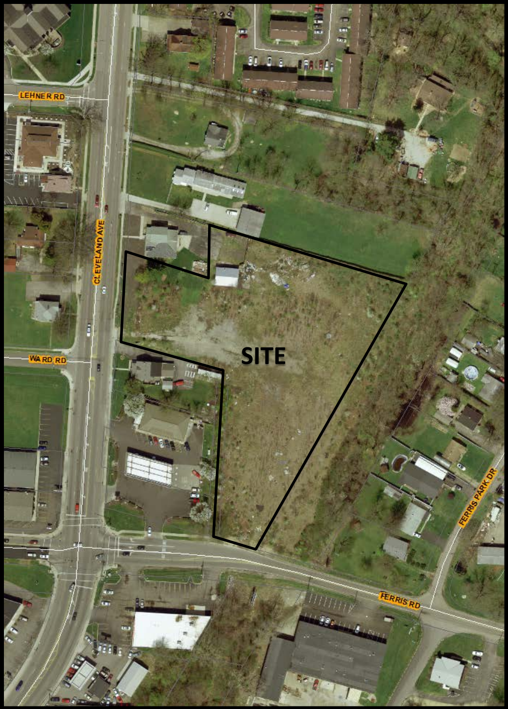
Z03-073A 4004 Cleveland Avenue Approximately 3.23 acres L-C-4 to L-C-4