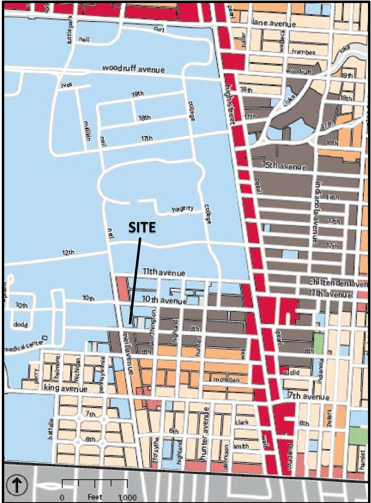
Z18-018 248 West Ninth Avenue Approximately 0.08 acres From AR-4 to UCRPD