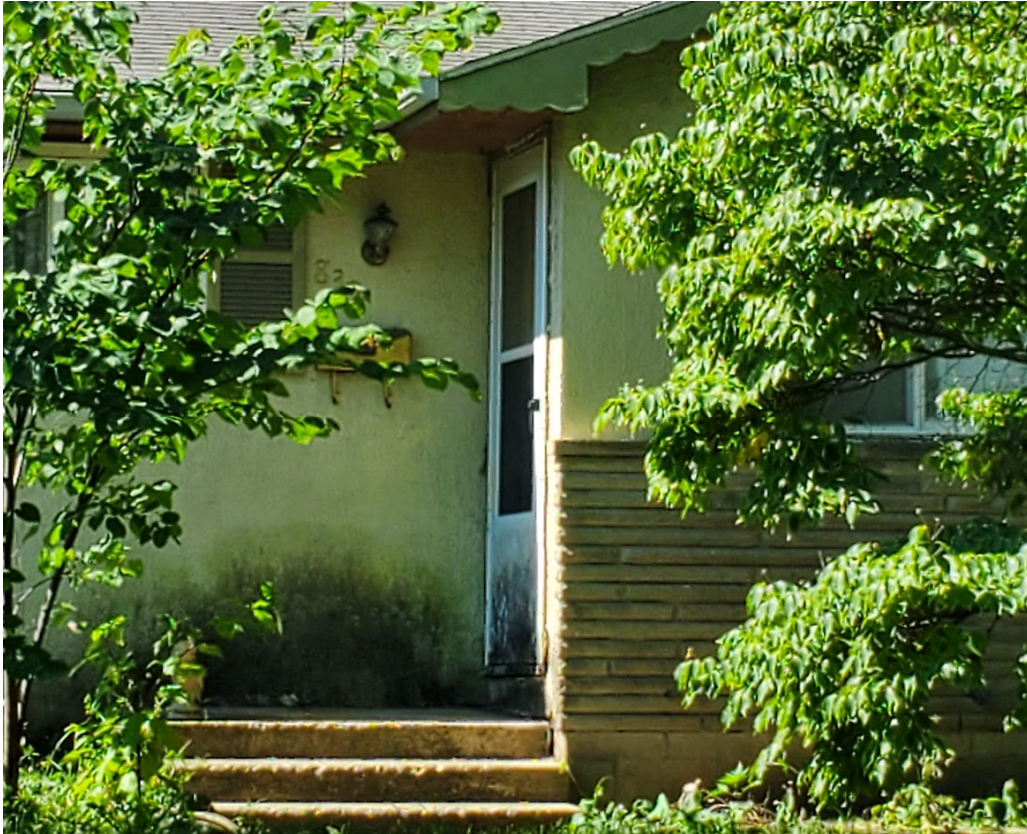
830 Minerva Ave.