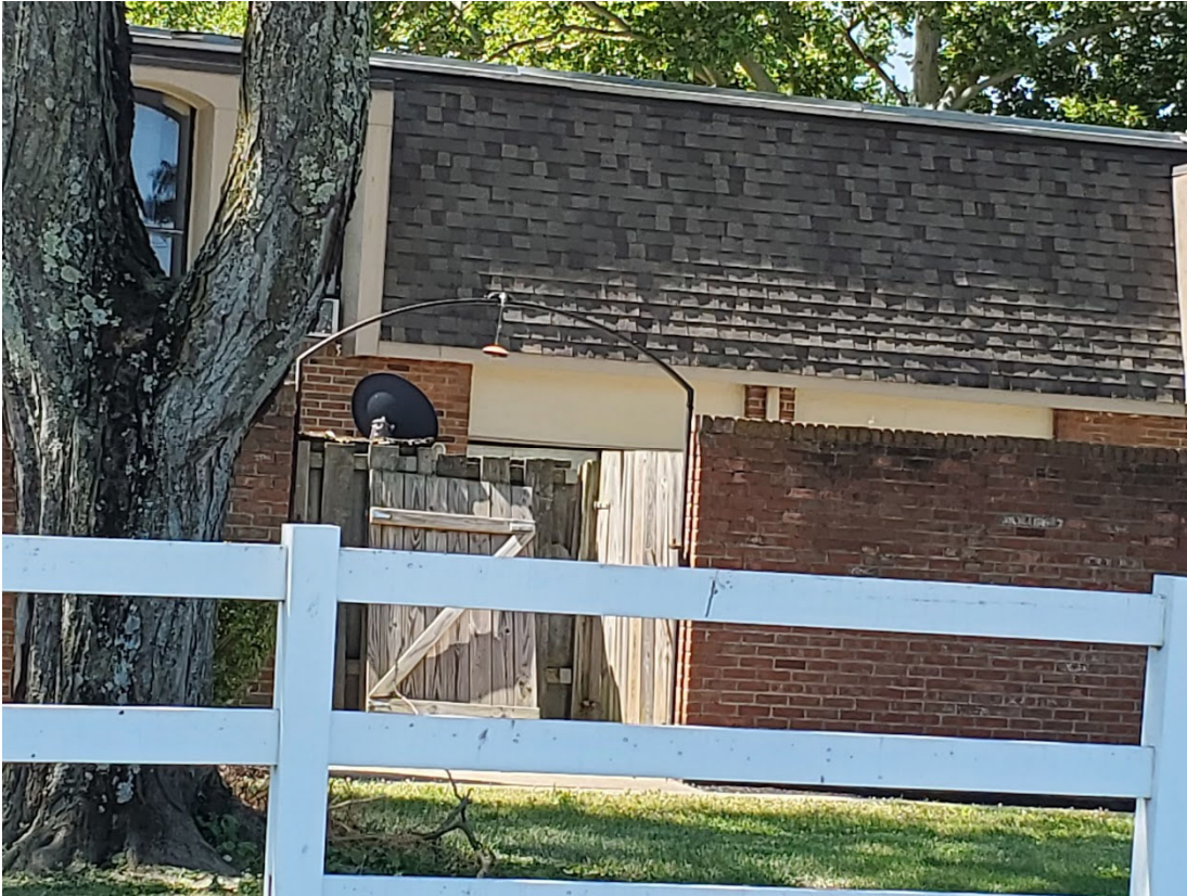
869-891 E Dublin-Granville Rd.