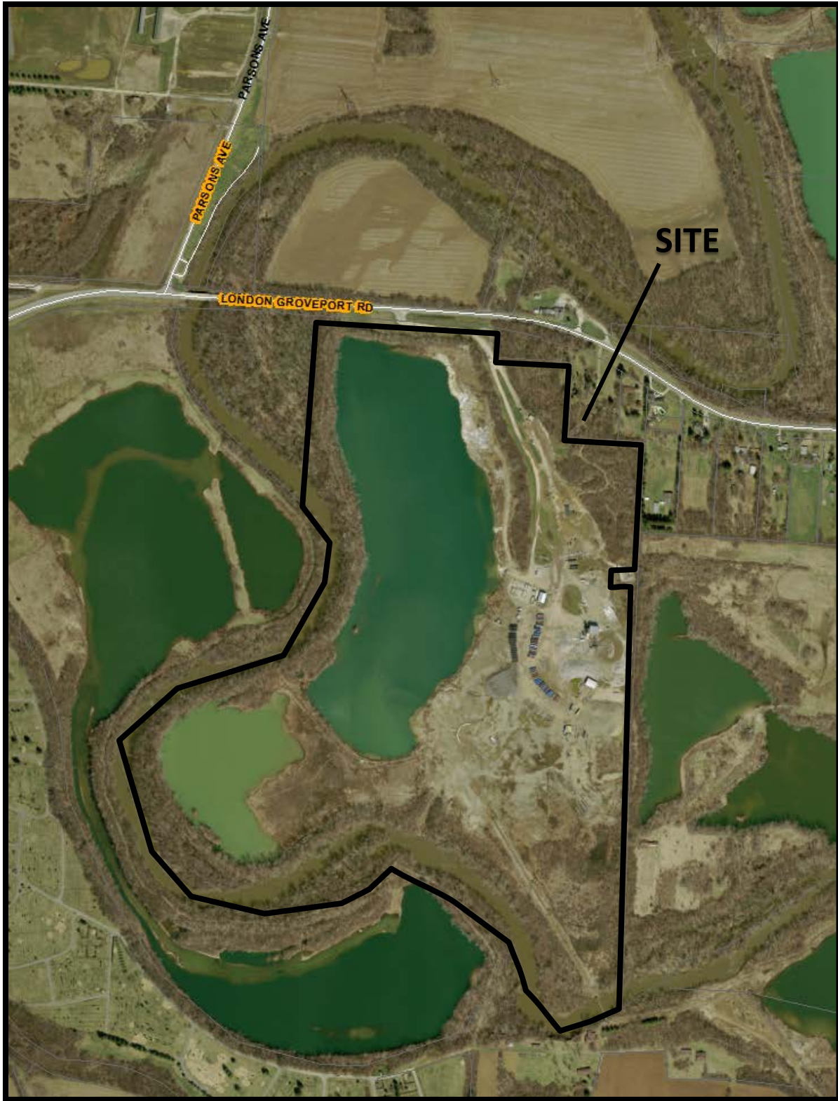
Z16-019 433 London Groveport Road Approximately 195.06 acres EQ to L-M