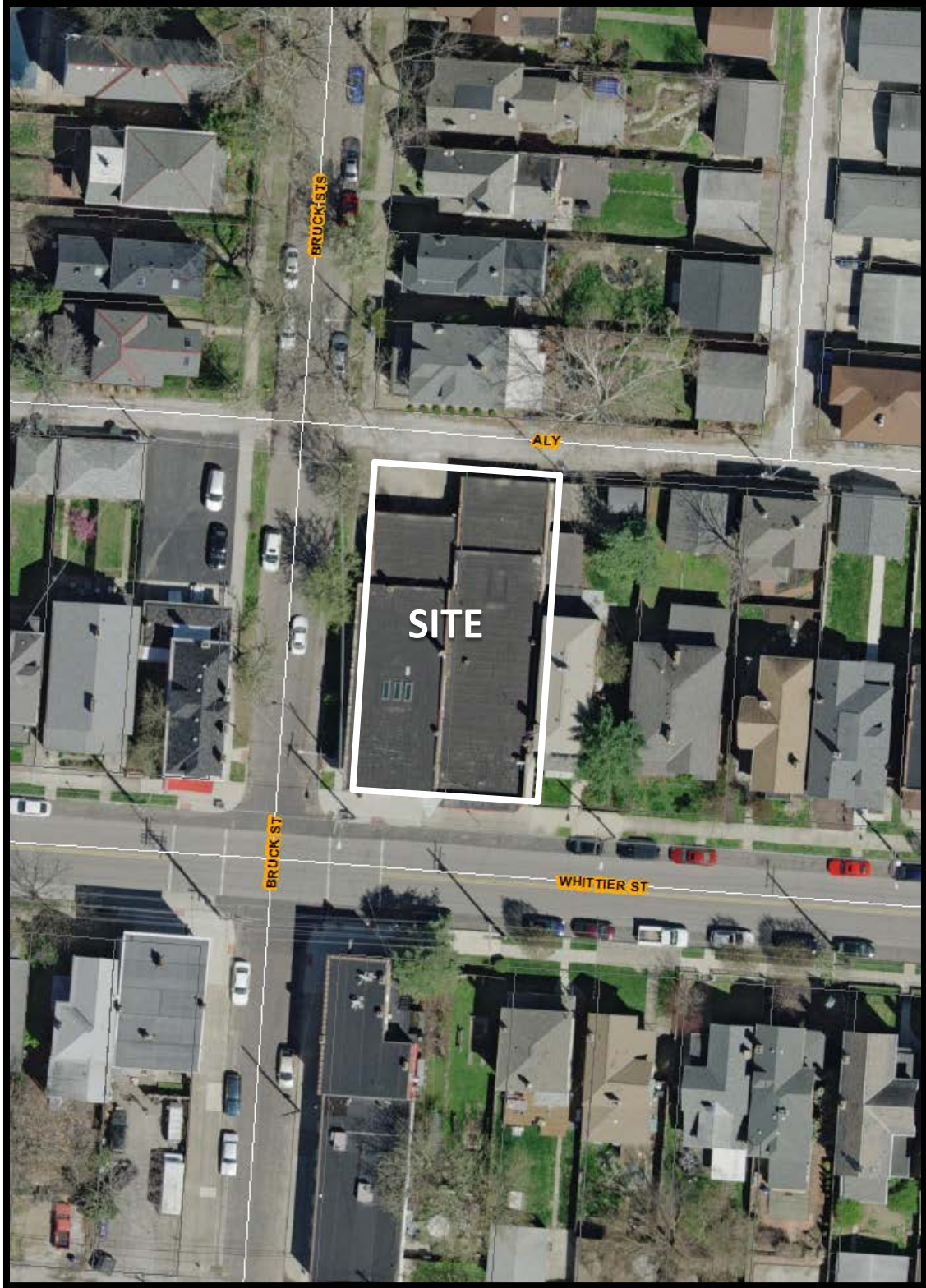
CV18-089 364 East Whittier Street Approximately 0.18 acres