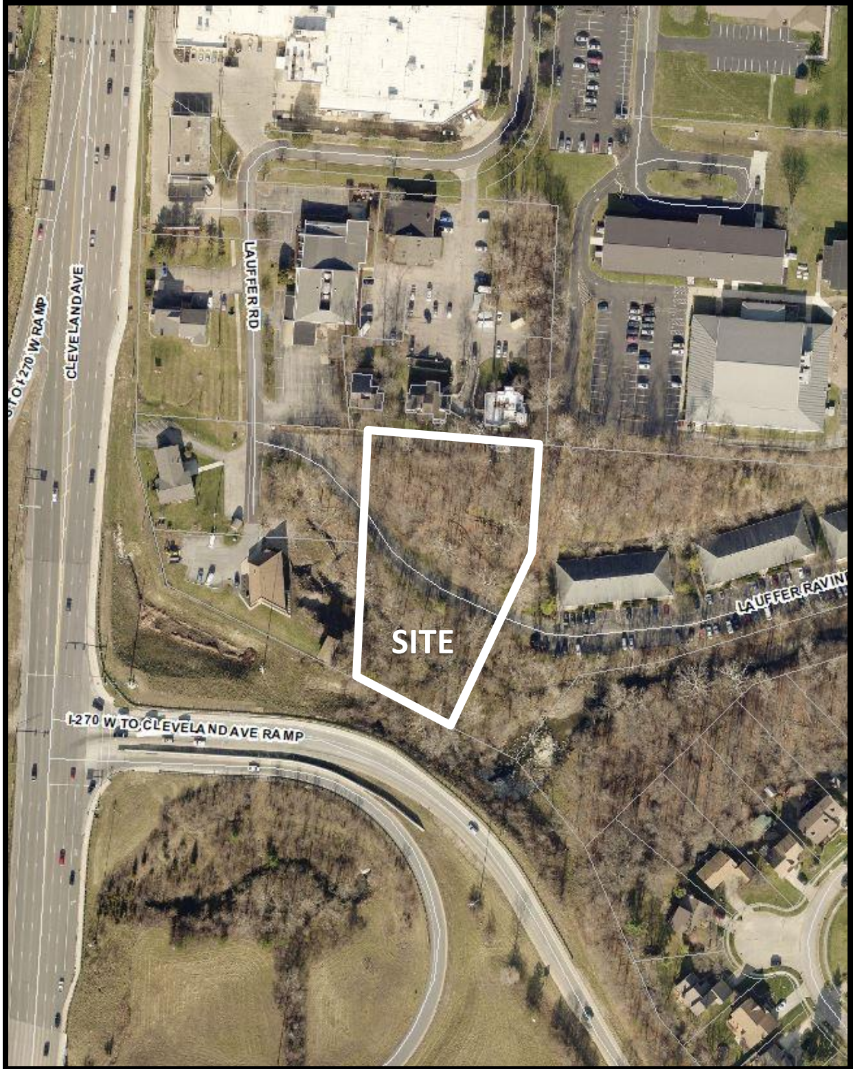
Z22-093 2600 Lauffer Ravines Dr. Approximately 1.66 acres C-2 to AR-12