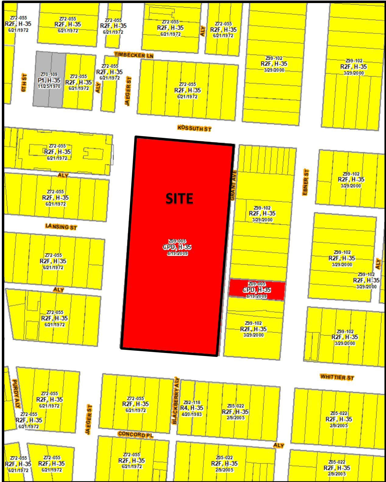
CV20-066 280 Whittier St. Approximately 2.34 acres