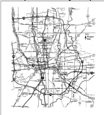
Example: Vicinity Map