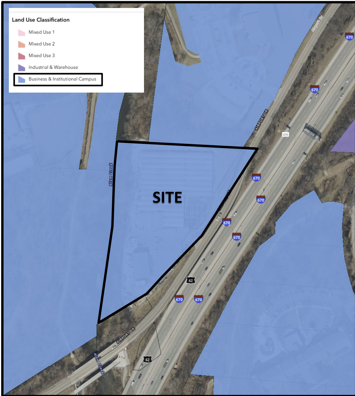
Columbus Growth Strategy (2026)

Z25-030 2500 Airport Dr. Approximately 5.5 acres R-1 to CPD