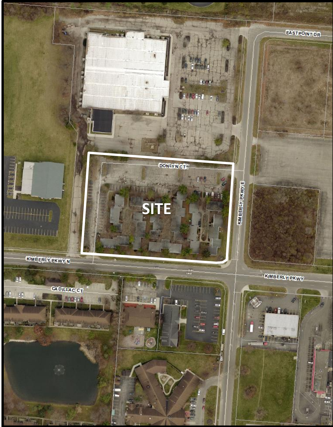
CV22-116 2337 Kimberly Parkway East Approximately 2.99 acres