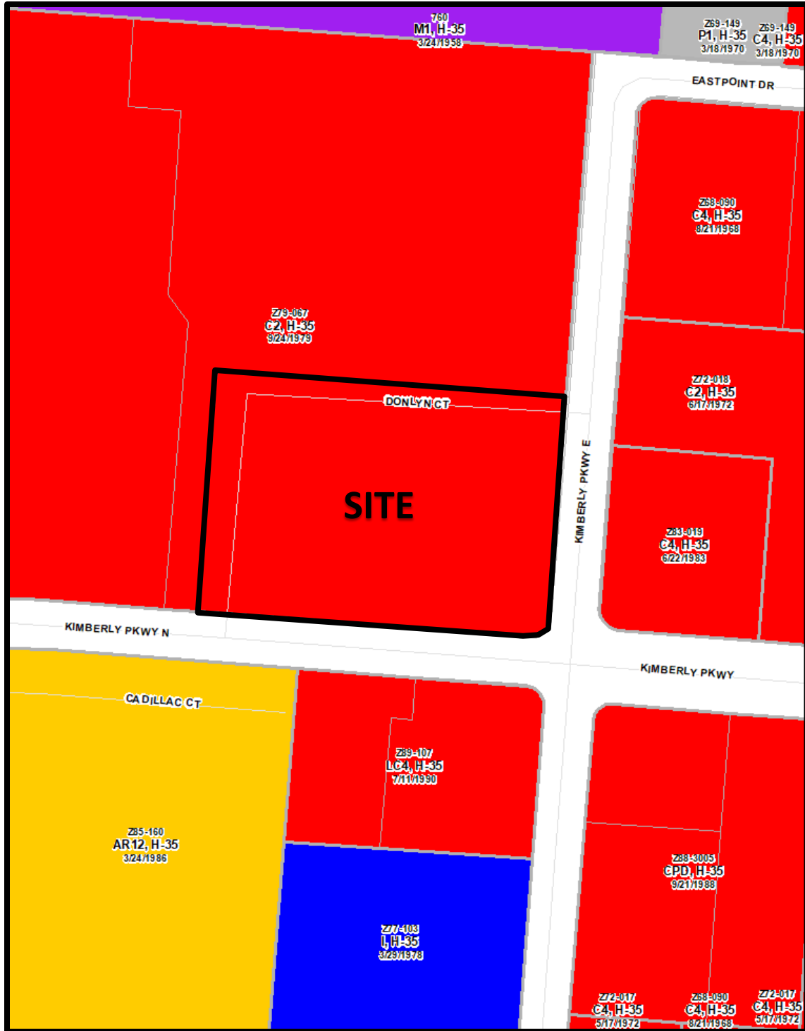
CV22-116 2337 Kimberly Parkway East Approximately 2.99 acres