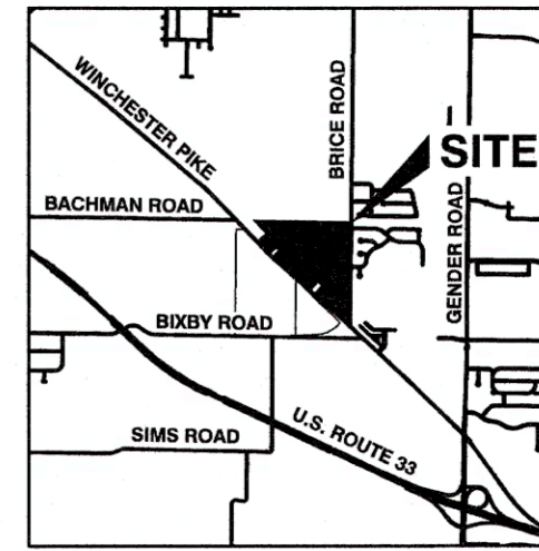
VICINITY MAP SCALE: 1" = 5000'

STATE OF OHIO, COUNTY OF FRANKLIN, TOWNSHIP OF MADISON, SOUTHEAST QUARTER SECTION 14 AND SOUTHWEST QUARTER SECTION 13, TOWNSHIP 11, RANGE 21, CONGRESS LANDS EAST OF THE SCIOTO RIVER.