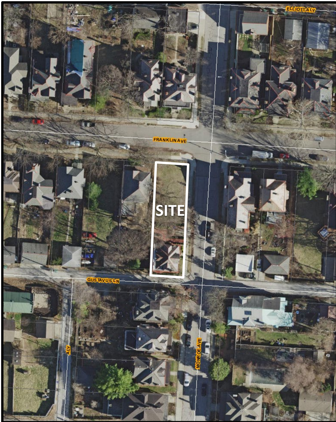
CV20-089 133 S. Monroe Ave. Approximately 0.12 acres