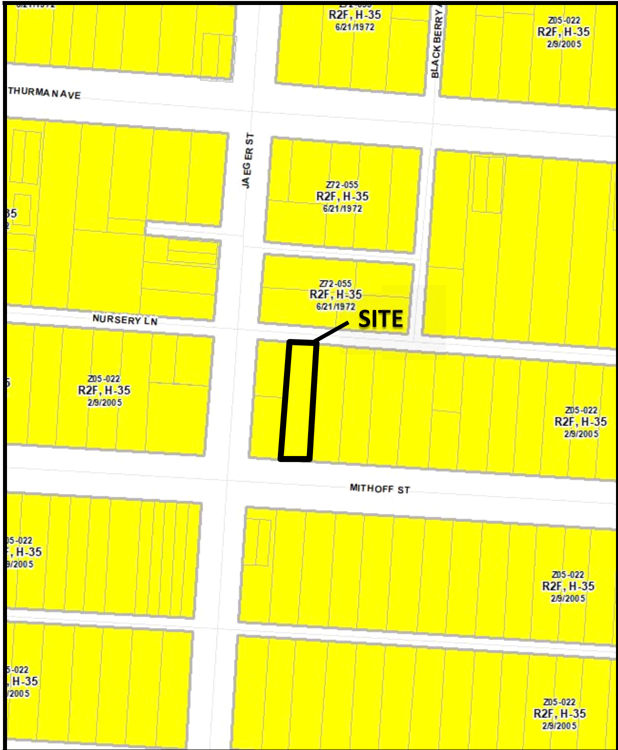
CV22-155 202 Mithoff St. Approximately 0.10 acres