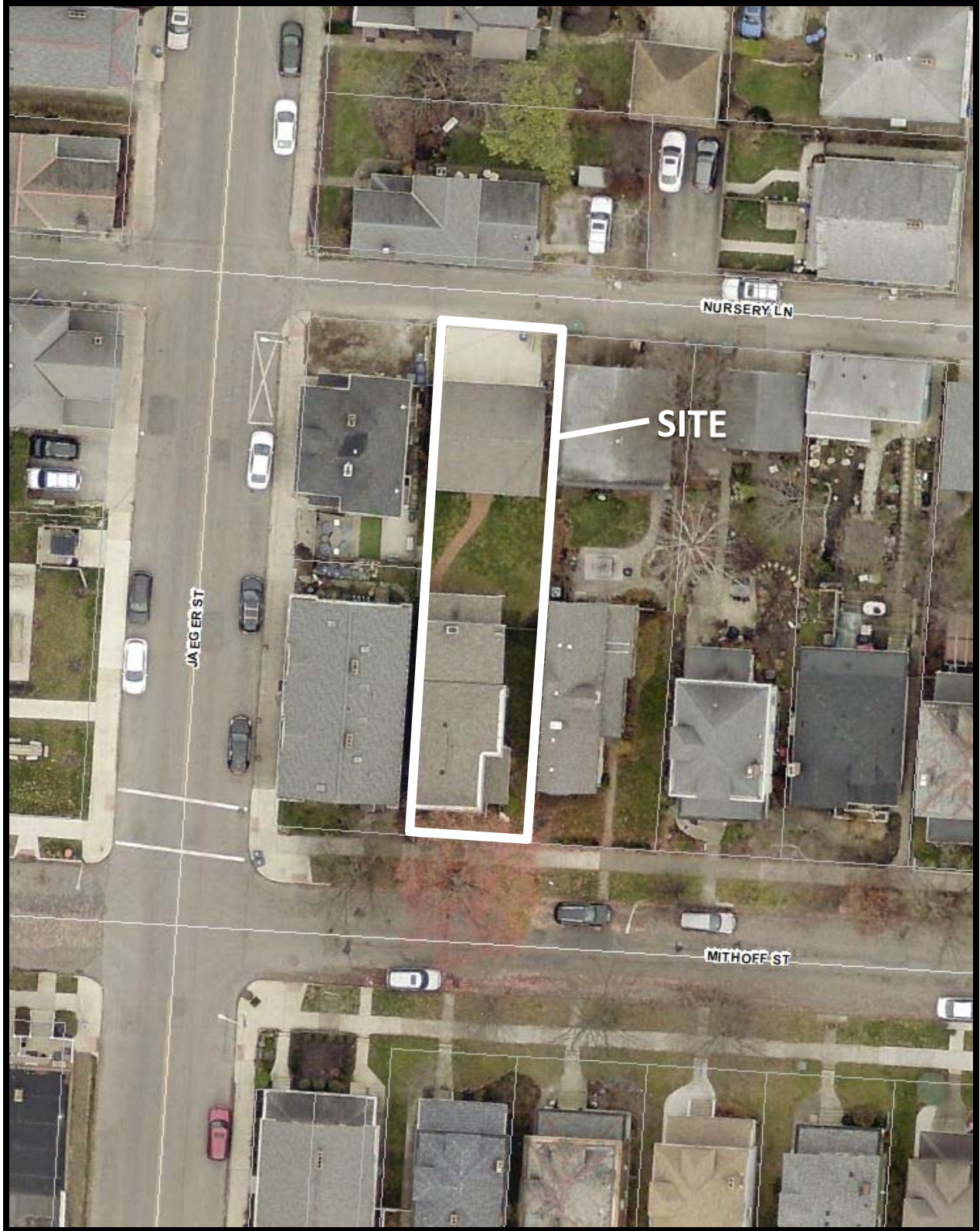
CV22-155 202 Mithoff St. Approximately 0.10 acres