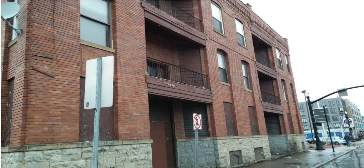
9 th Avenue and High Street