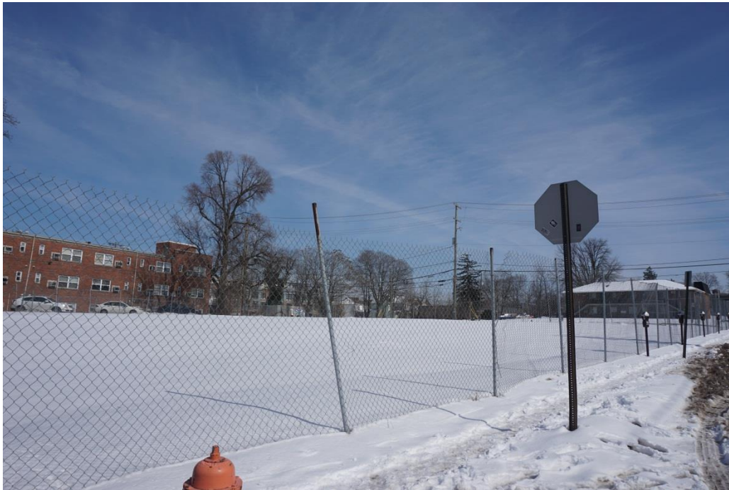
8 th Avenue and High Street