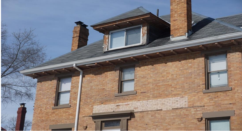
2305 N. High St – Side View