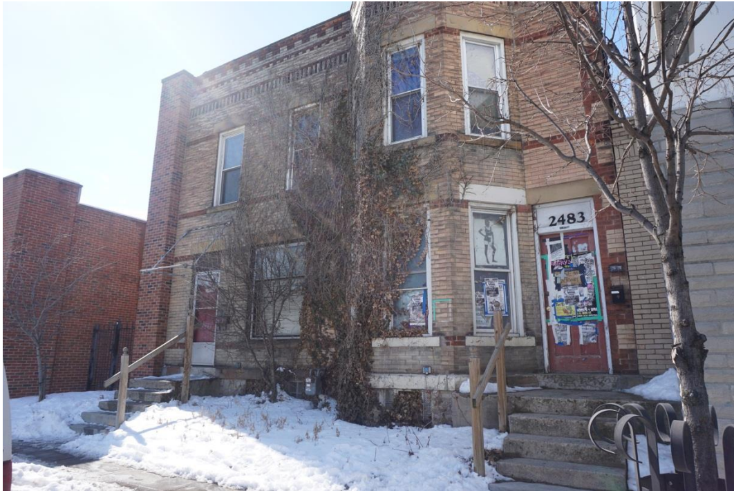
2483 N. High