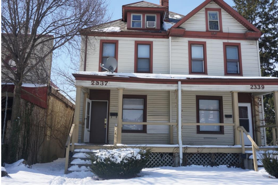
2337-2339 N. High