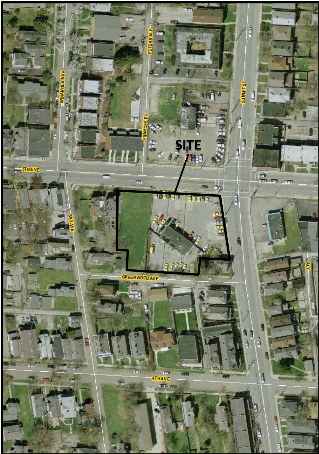
CV14-053 97 East Fifth Avenue Approximately 0.90 acres