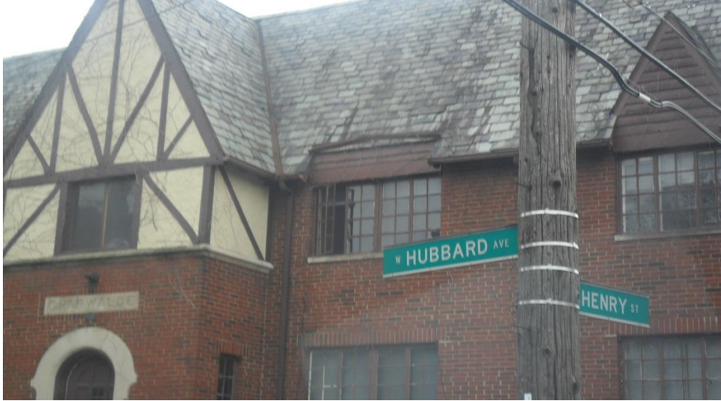
791-833 Henry Street