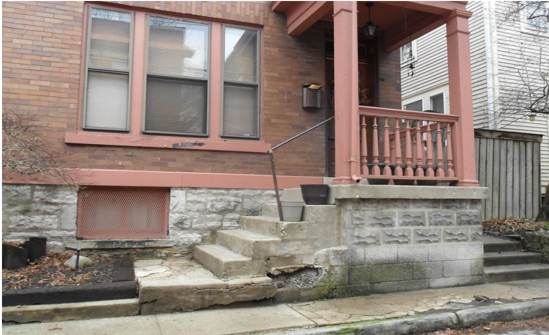
868-871 Delaware Ave