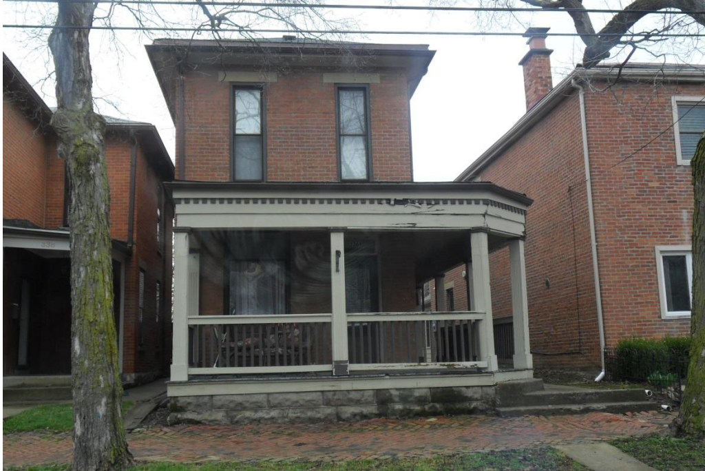
336 B W. 1 st Ave