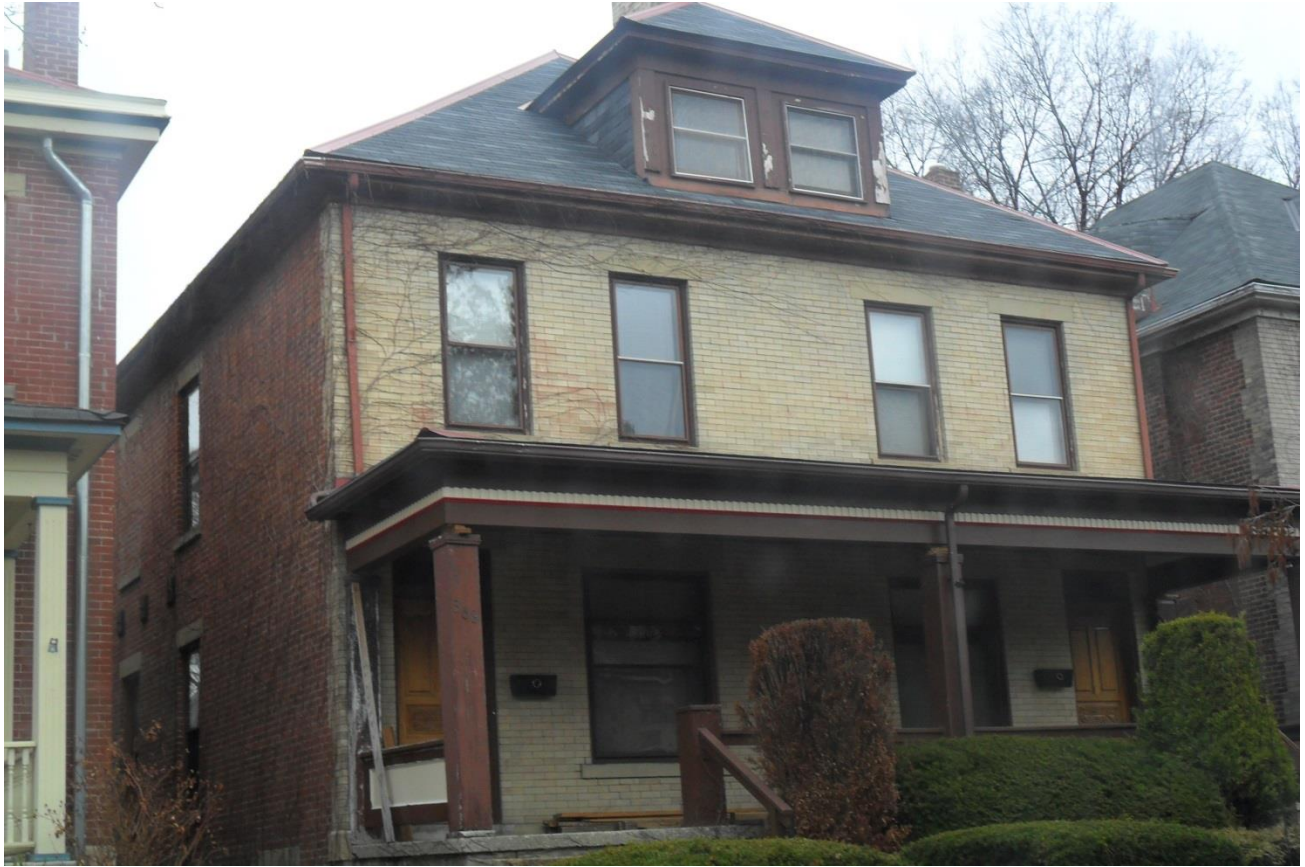
364-368 Henry Street