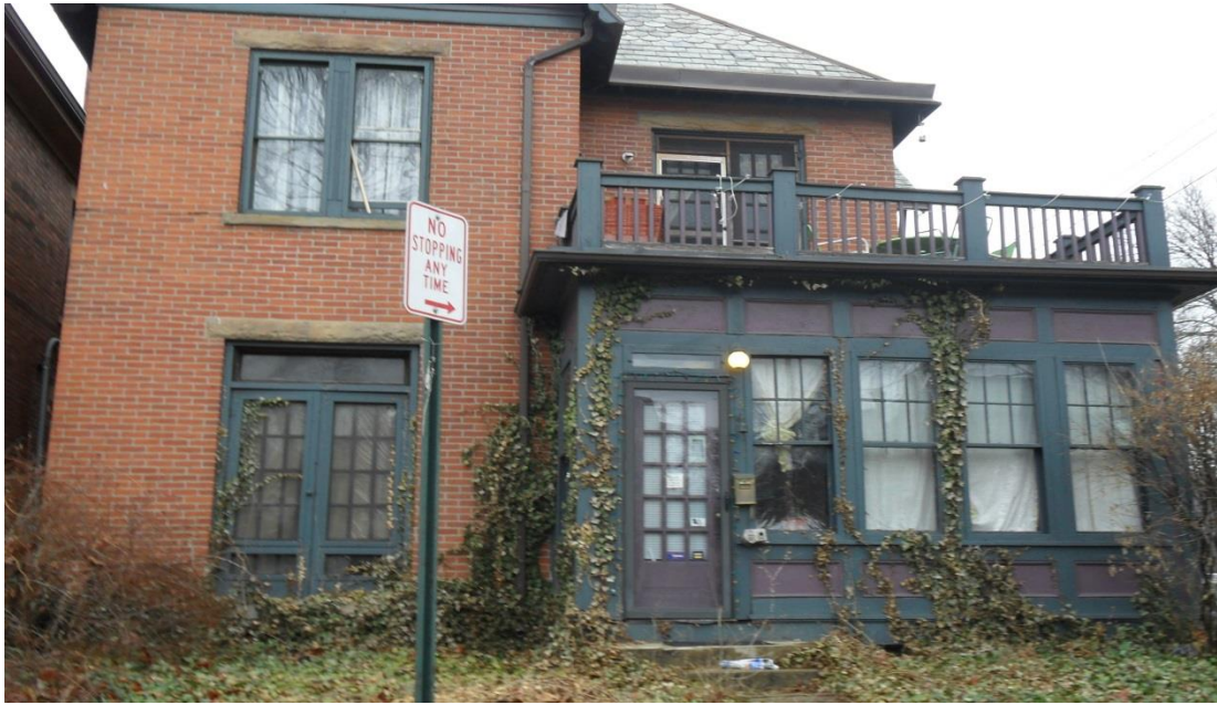
328 Wilber Ave