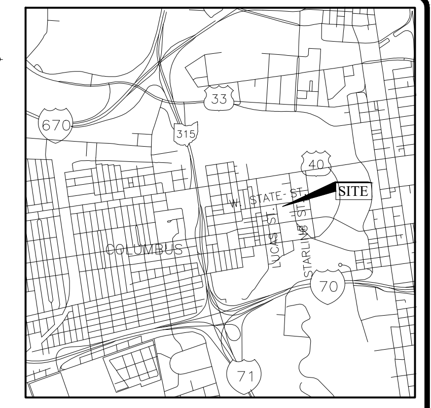
SITE LOCATION MAP SCALE: NOT TO SCALE