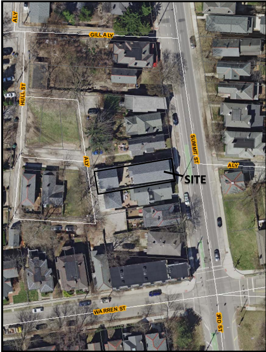
CV21-048 783 Summit Street Approximately 0.08 acres