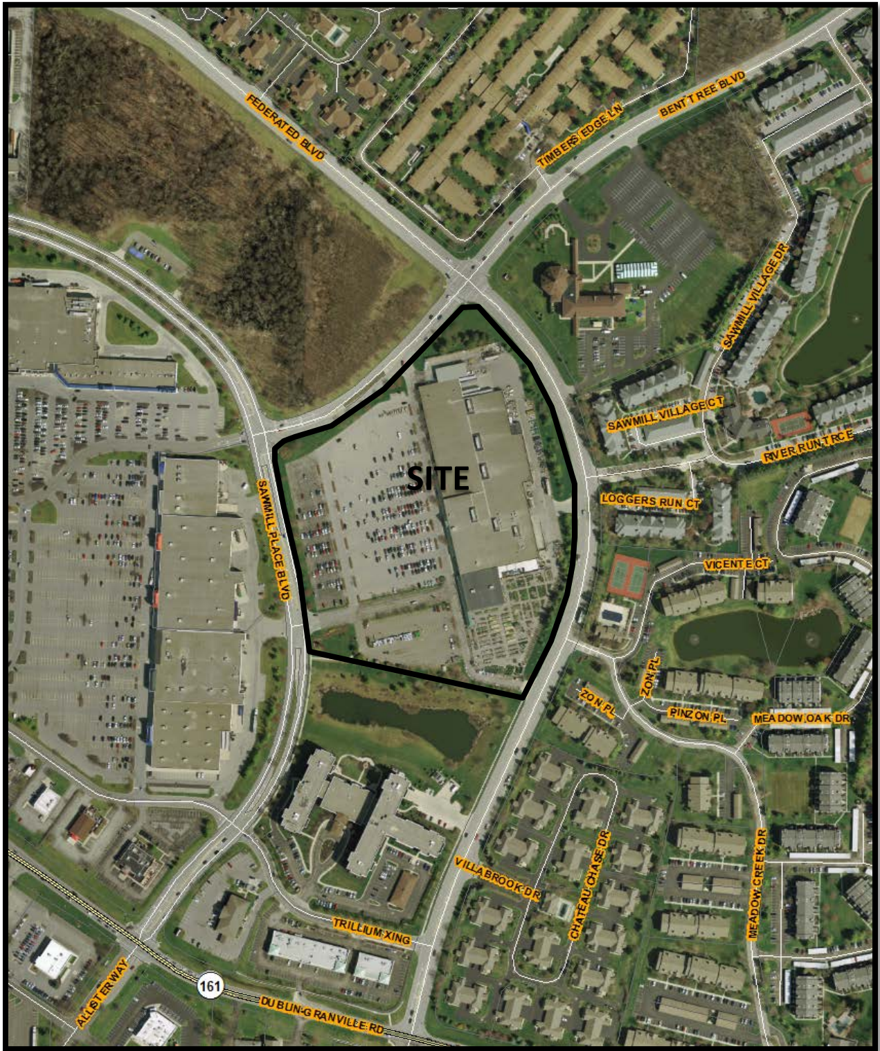
CV17-020 7000 Bent Tree Boulevard Approximately 16.71 acres