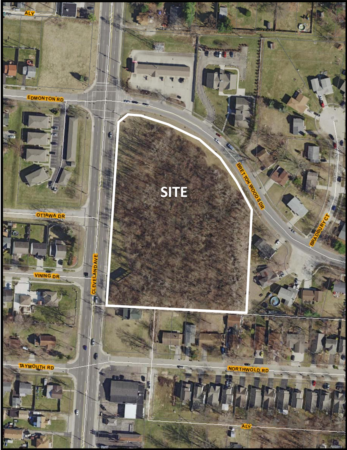
CV19-117 4836 Cleveland Ave. Approximately 4.38 acres