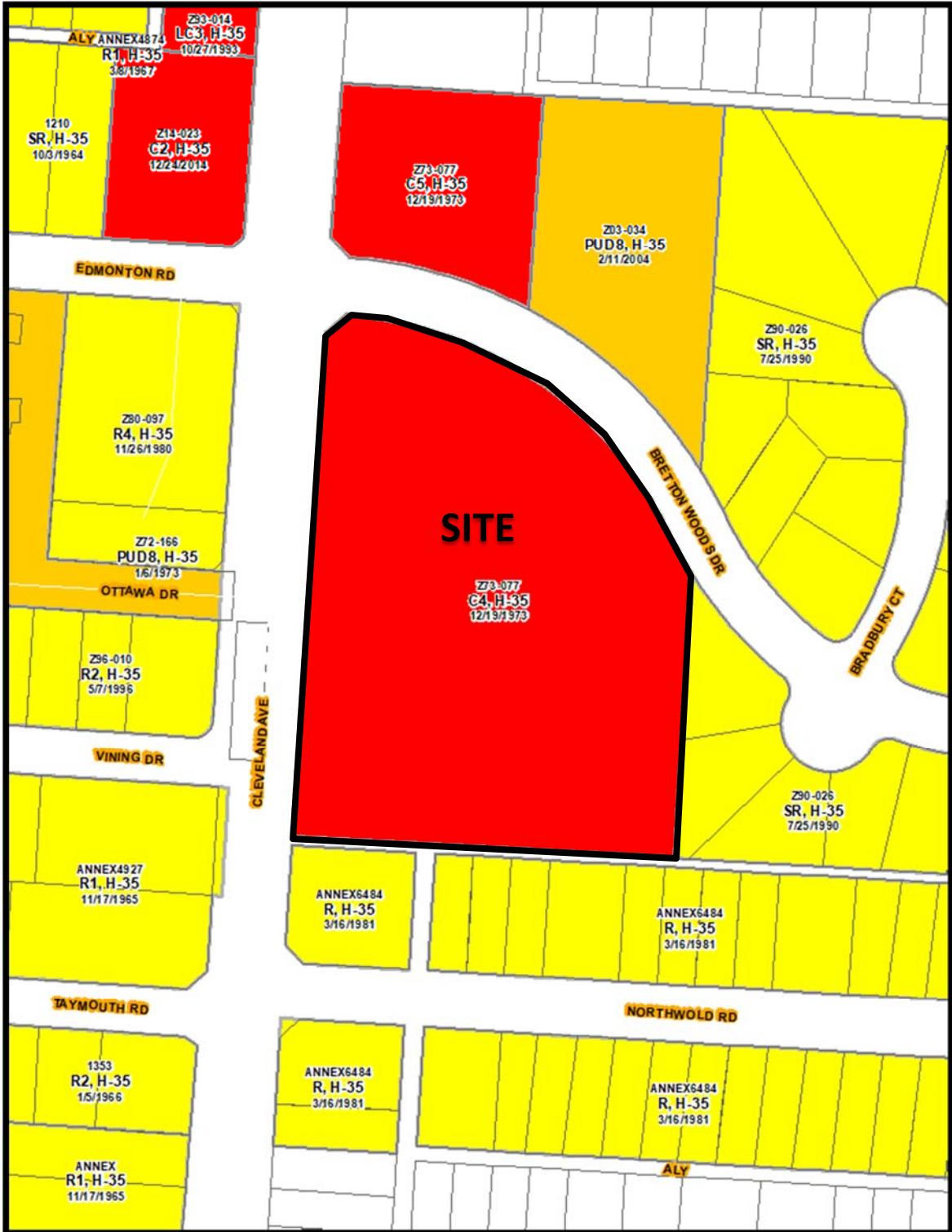
CV19-117 4836 Cleveland Ave. Approximately 4.38 acres