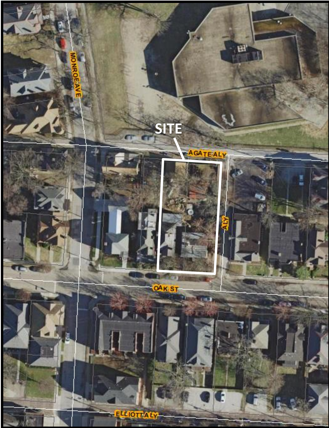
CV20-038 824 Oak St. Approximately 0.27 acres