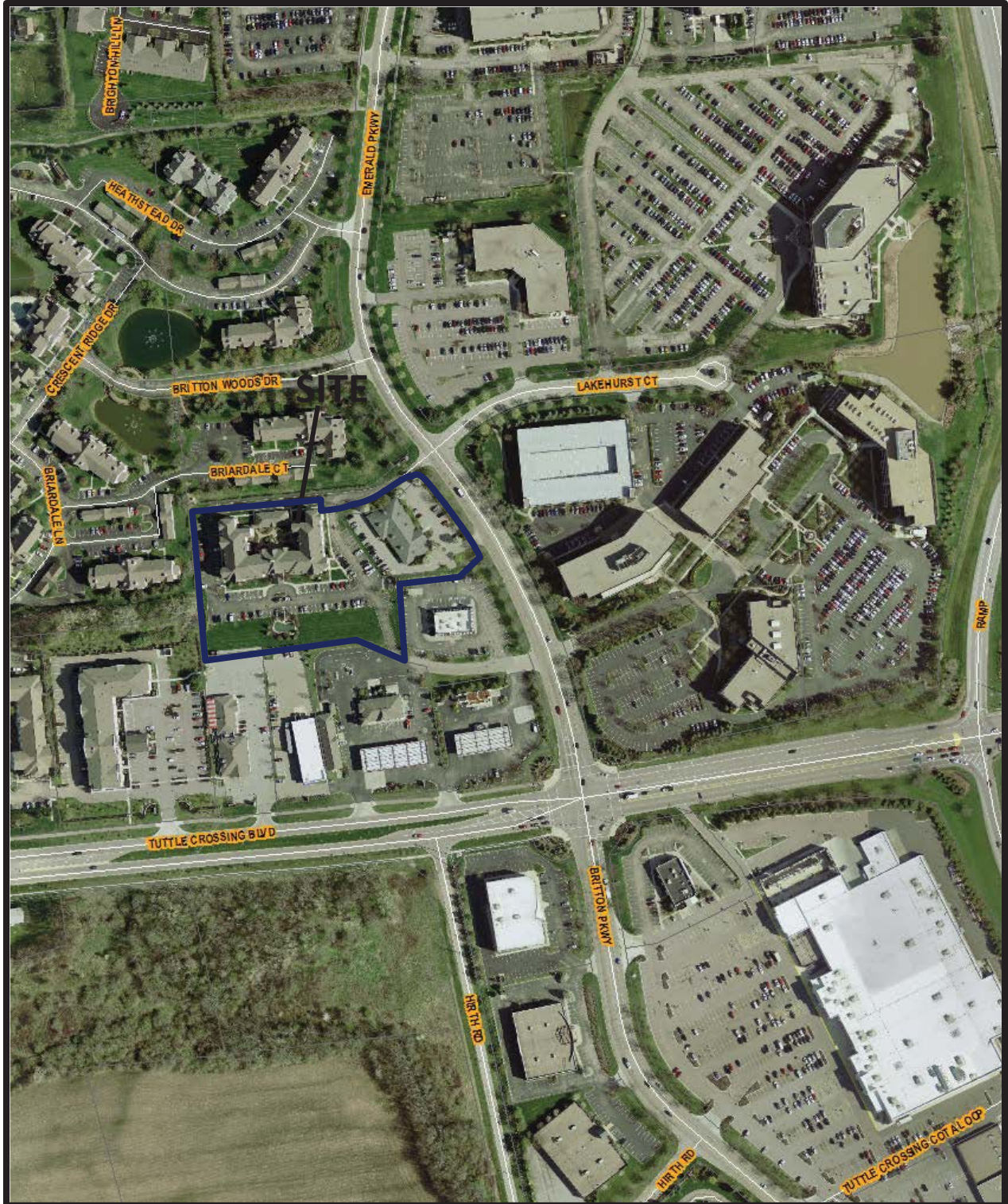
Z90-104B 6085 & 6095 Emerald Parkway