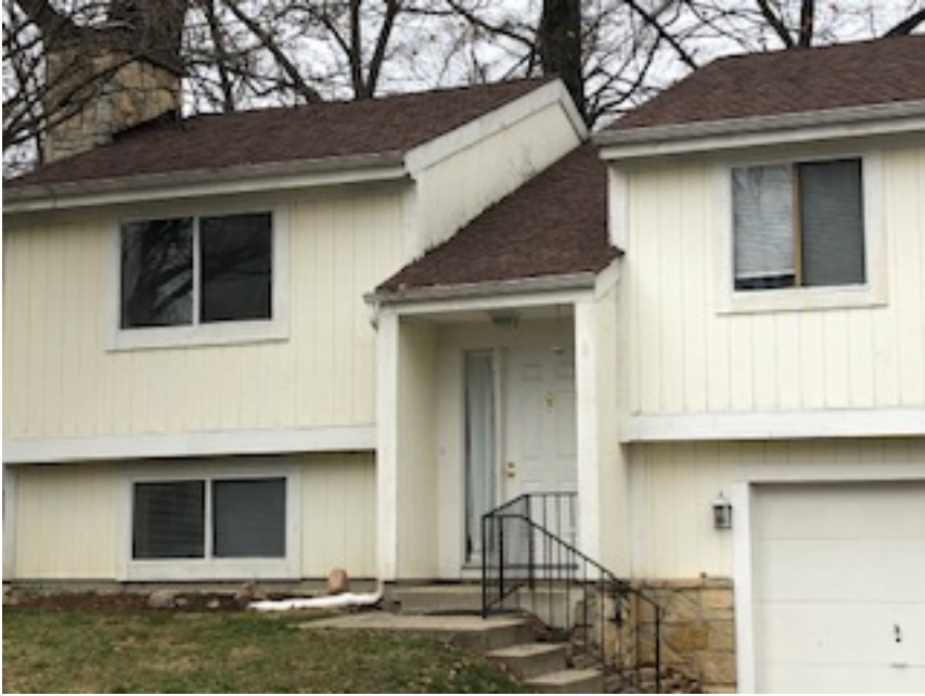
3936 Spyglass Dr.