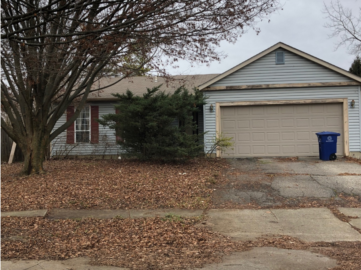
2181 Ransom Oaks Dr