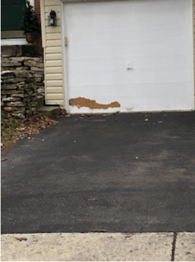
2211 Green Island Dr