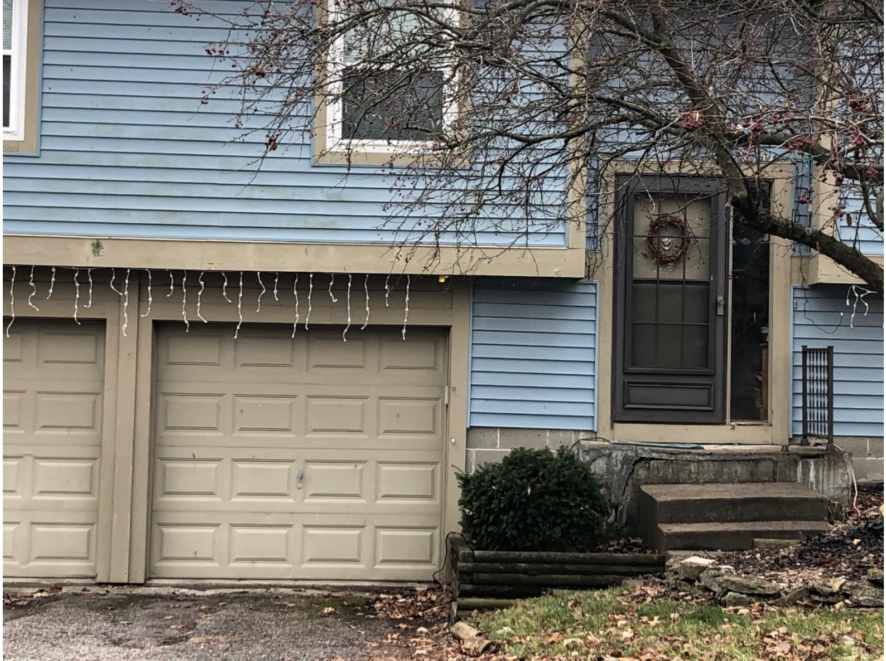
3735 Quail Hollow Dr