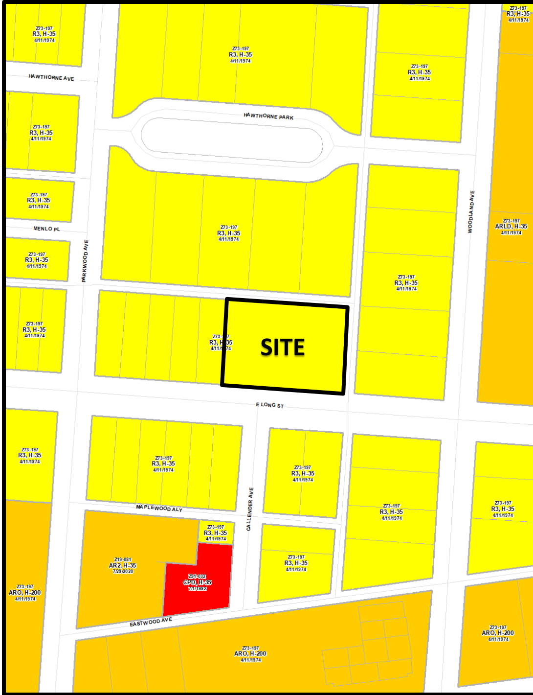
CV23-097 1600 E. Long St. Approximately 0.74 acres