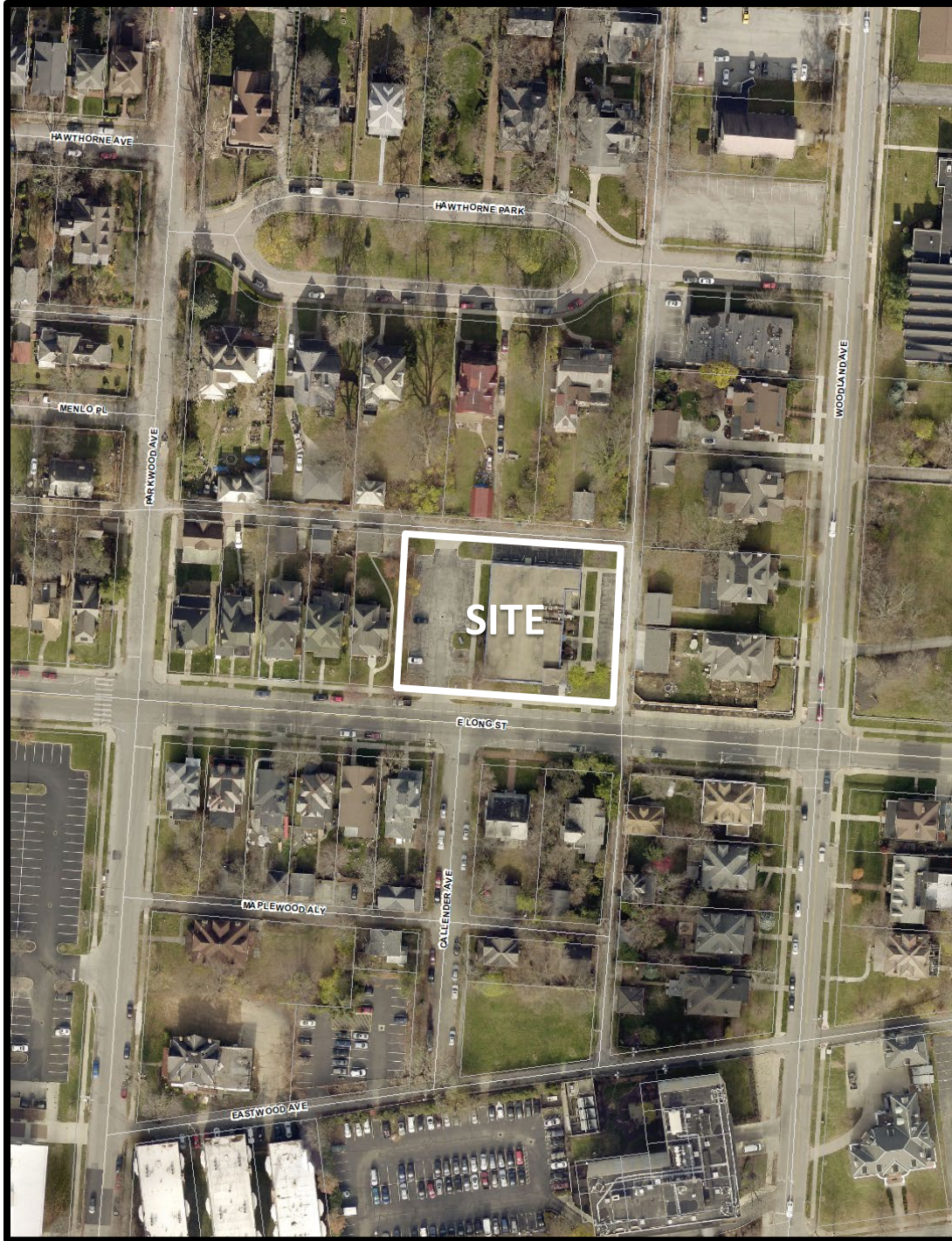
CV23-097 1600 E. Long St. Approximately 0.74 acres