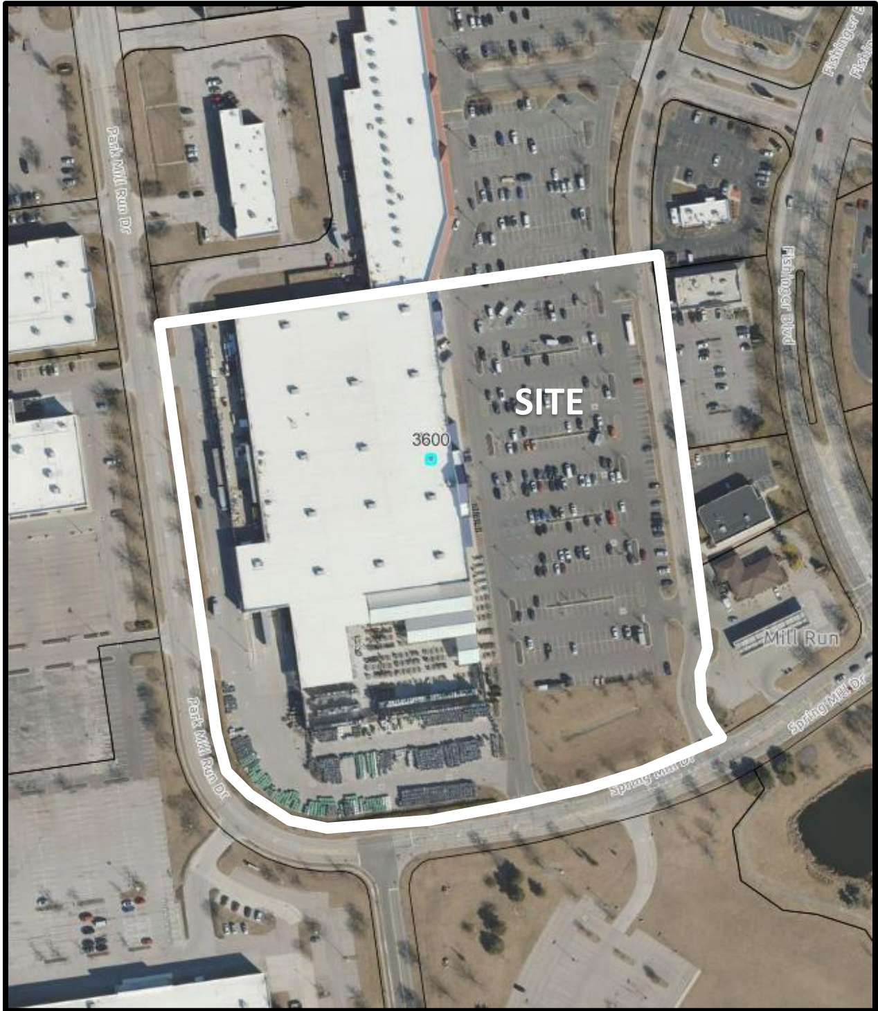
Z25-049 3600 Park Mill Run Drive. Approximately 12.56 acres CPD to CPD