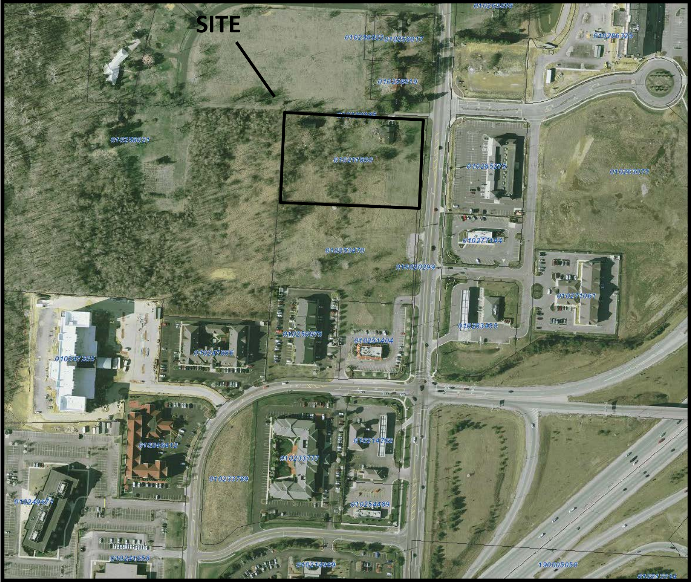
Z88-1844A 1463 North Cassady Avenue