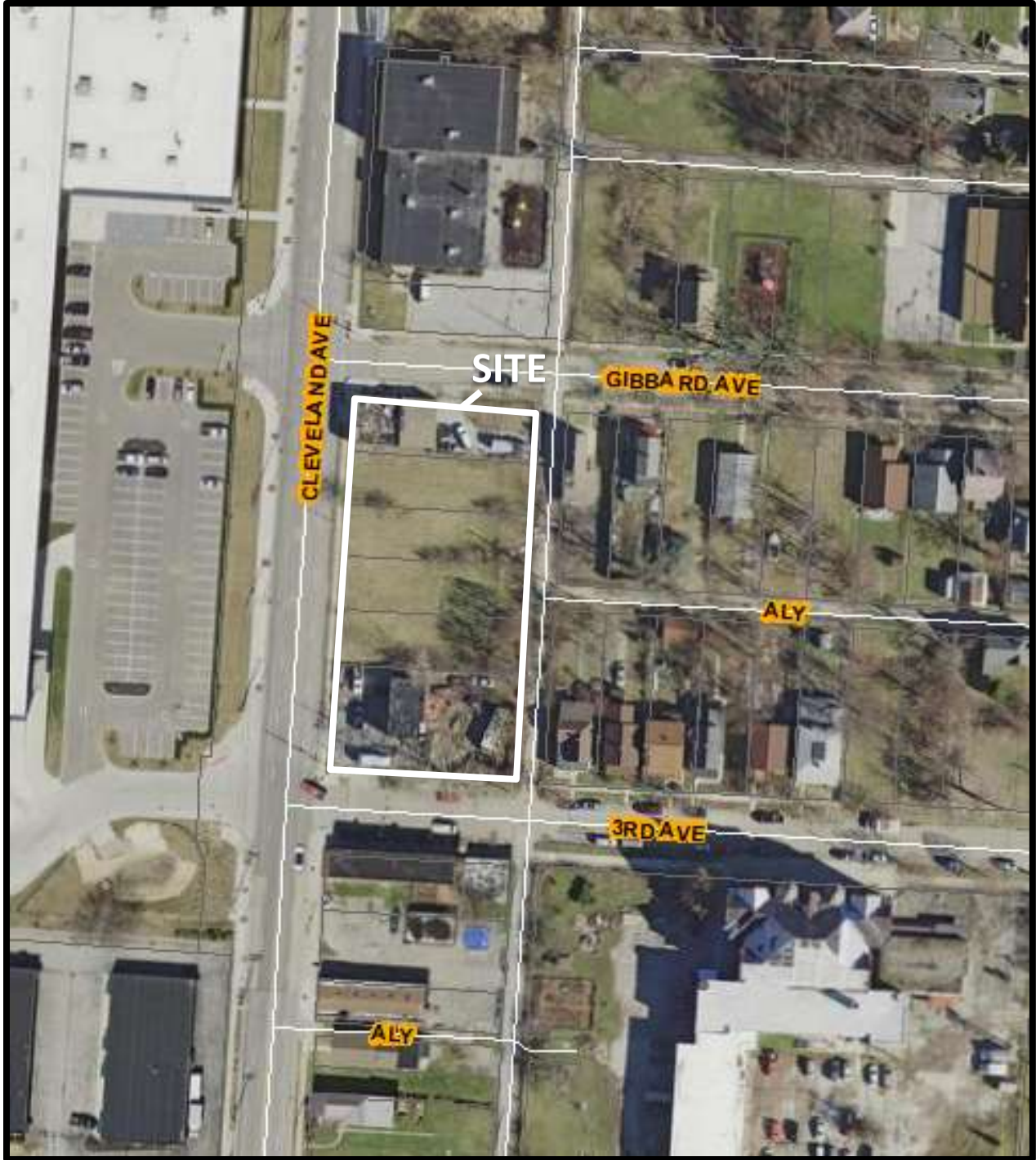
CV20-072 986 Cleveland Ave. Approximately 0.78 acres