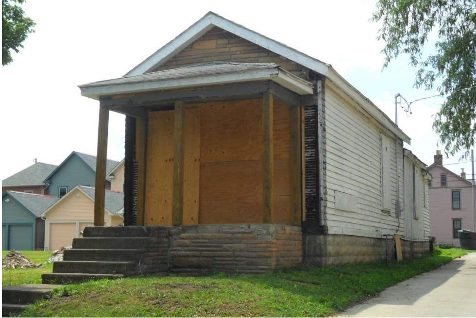
150 Punta Alley