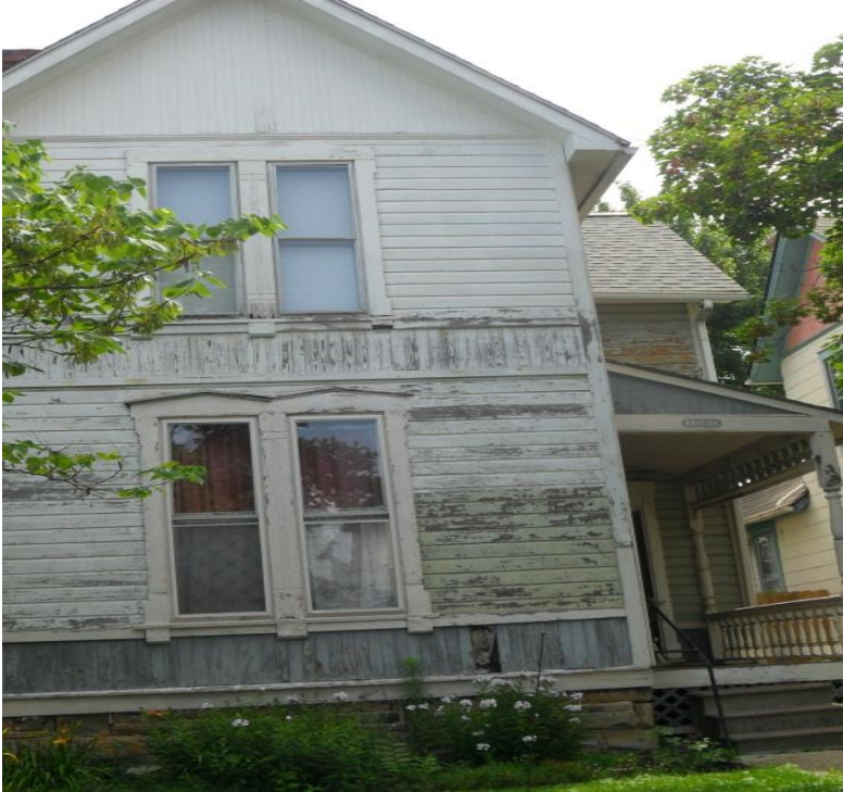
1080 Say Avenue