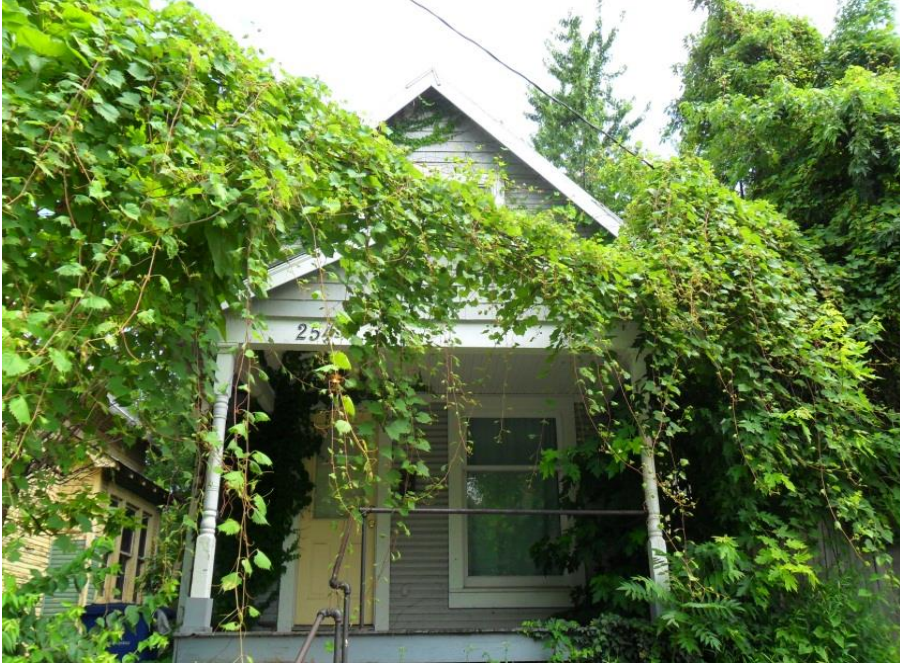
254 Detroit Ave