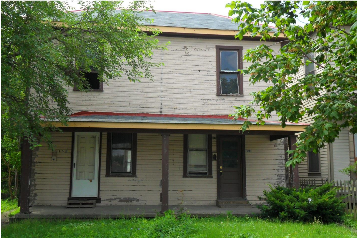
159-161 E. 4 th