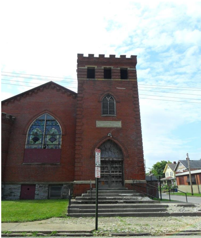
Bethany Baptist Church