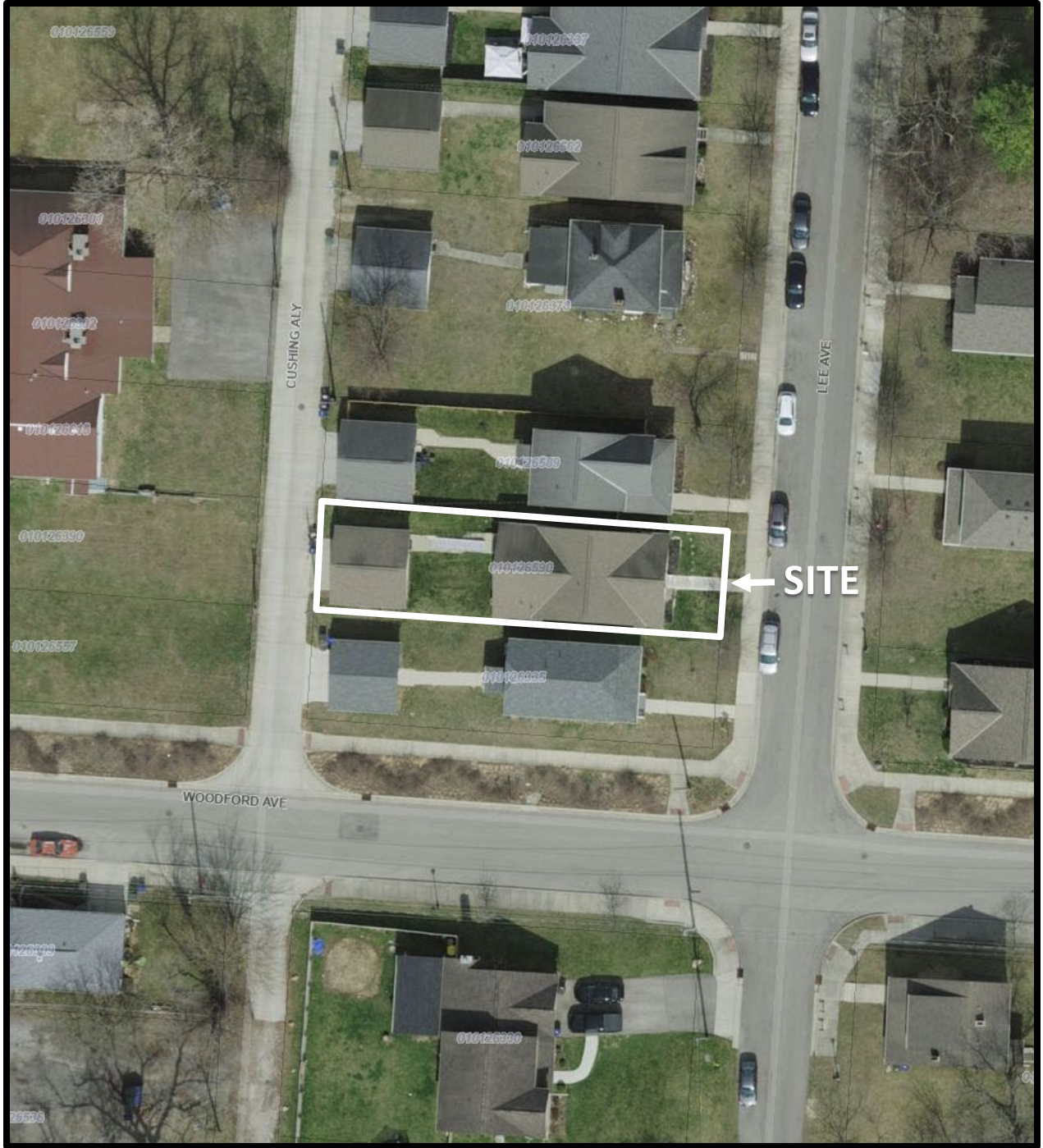
CV25-108 1309 Lee Ave. Approximately 0.10 acres