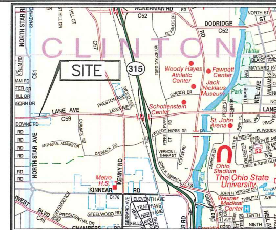
Location Map Not To Scale

ROBERT S. HART DB. 3766 PG. 512 1370 Lane Ave. 0.2181 AC.