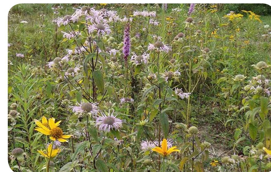
Pollinator and Wildflower Mix