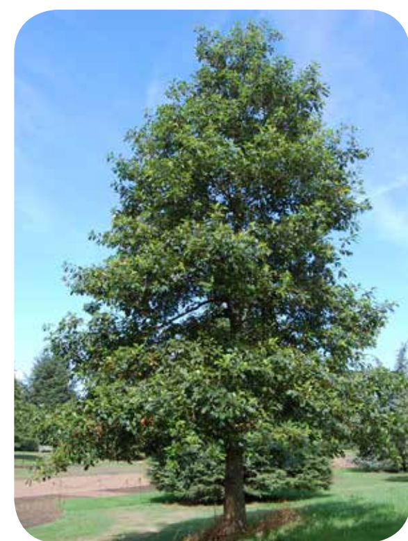
Swamp White Oak