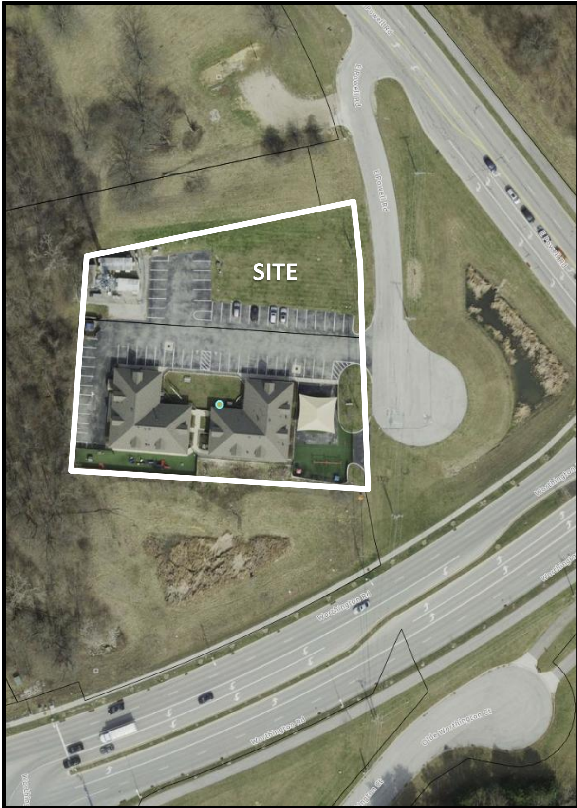
Z25-039 3812 E. Powell Rd. Approximately 1.49 acres R to L-C-4