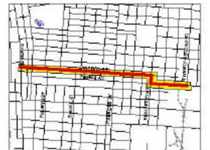
7. Merion Southwood