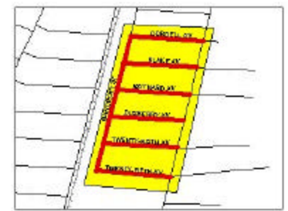
2. Argyle Park