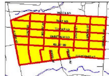
1. South Clintonville