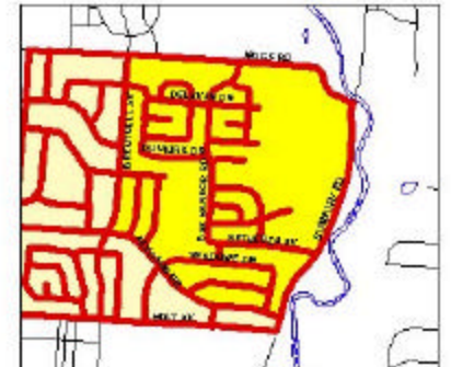
4. Brittany Hills