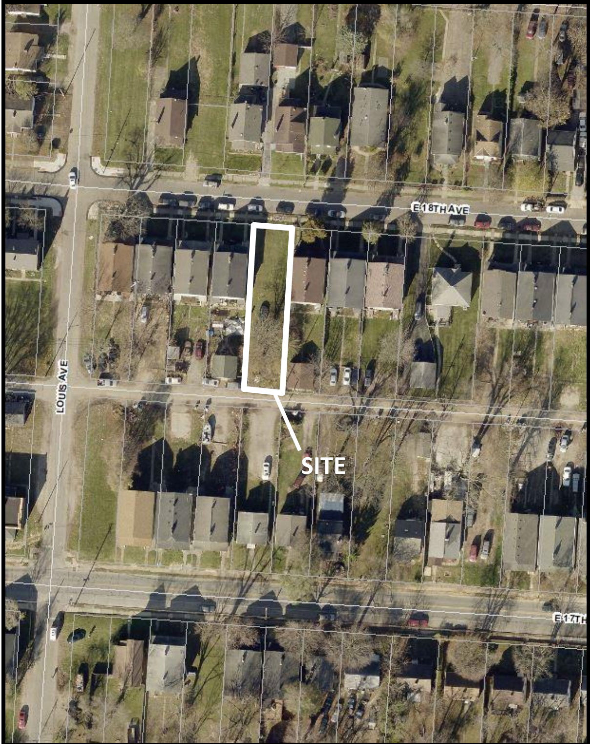
CV22-134 1333-1335 E. 18 th Ave. Approximately 0.13 acres