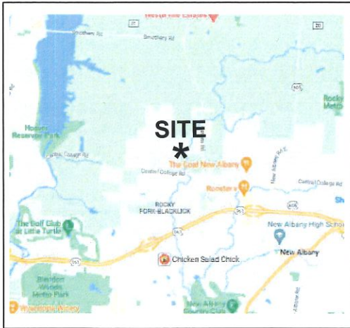
Location Map - NTS

Length of Contiguity: ±1833.6 feet Total Length of Perimeter: ±3383.6 feet Percentage of Contiguity: ±54.2%