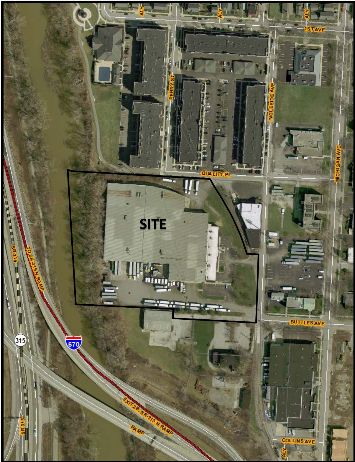
CV16-066 871 Ingleside Avenue Approximately 7.03 acres