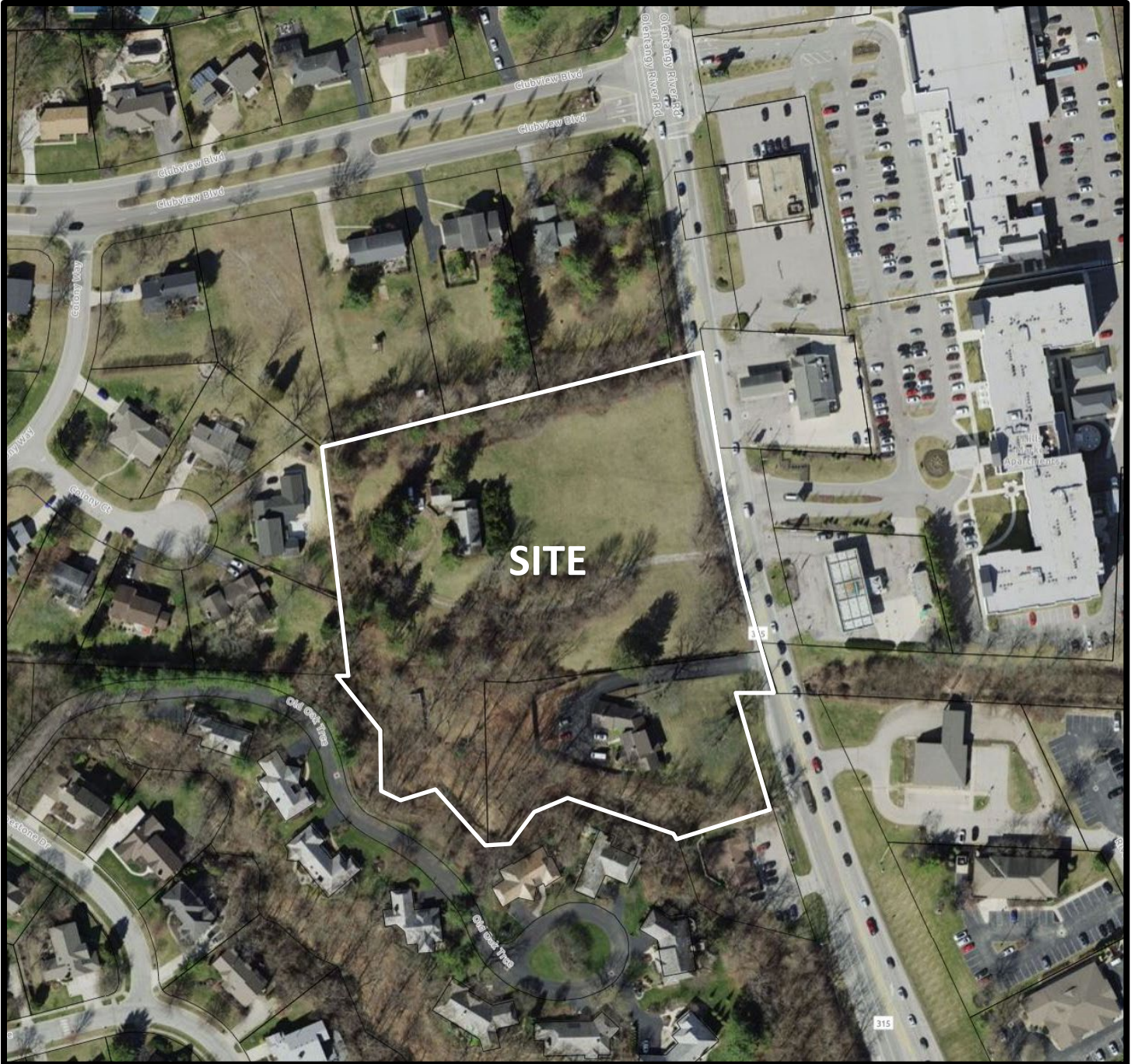
CV25-073 7801 AND 7089 OLENTANGY RIVER RD. (43235) Approximately 5.82 acres