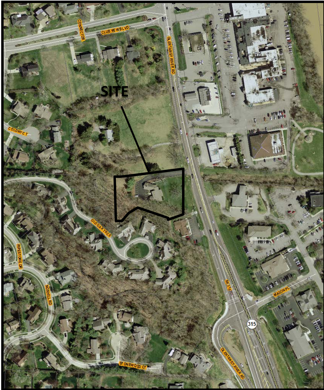
CV14-012 7801 Olentangy River Road Approximately 1.46 acres