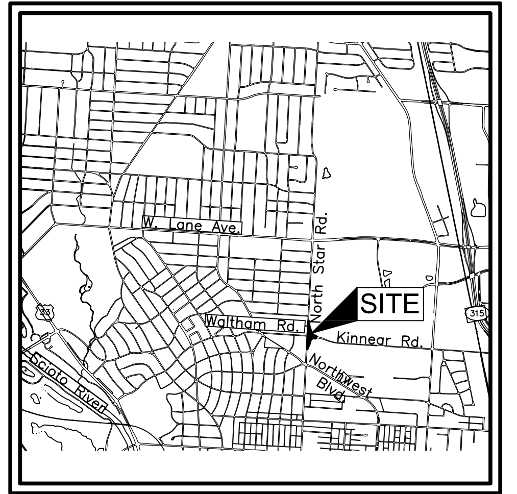
LOCATION MAP AND BACKGROUND DRAWING SCALE: 1" = 3000'

QUARTER TOWNSHIP 3, TOWNSHIP 1, RANGE 18 UNITED STATES MILITARY LANDS CITY OF COLUMBUS, COUNTY OF FRANKLIN, STATE OF OHIO