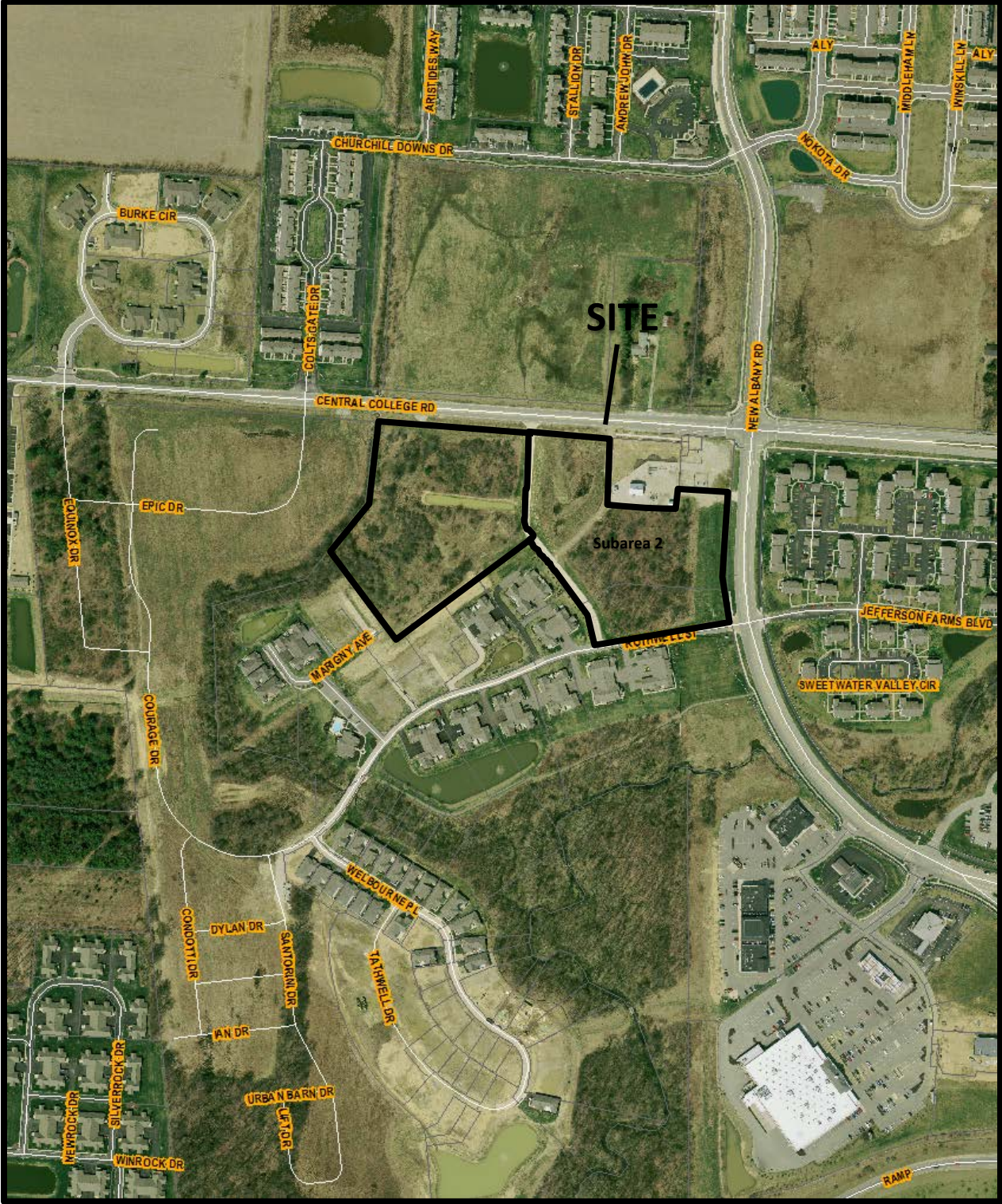
Z05-094A 6037 Central College Road