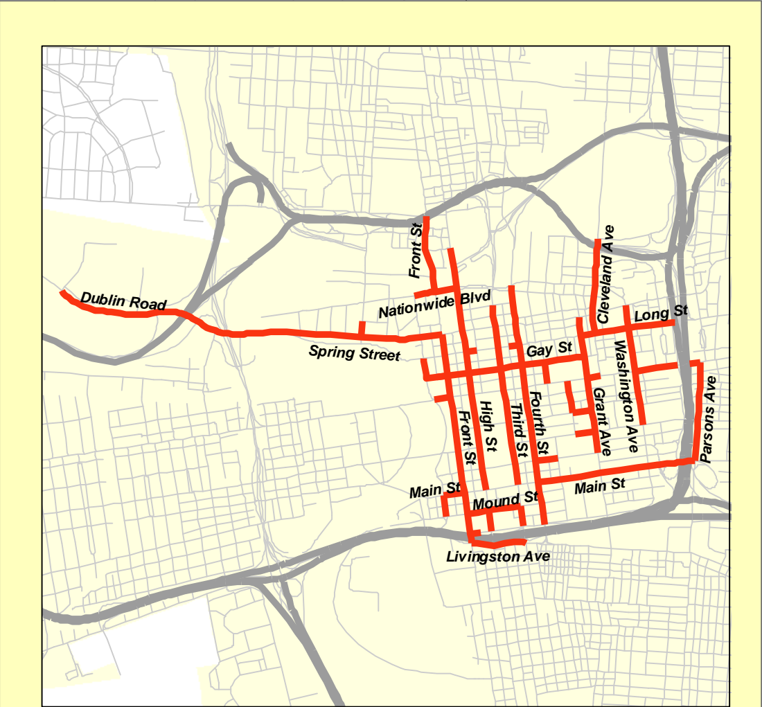
Central Business District Inset Map