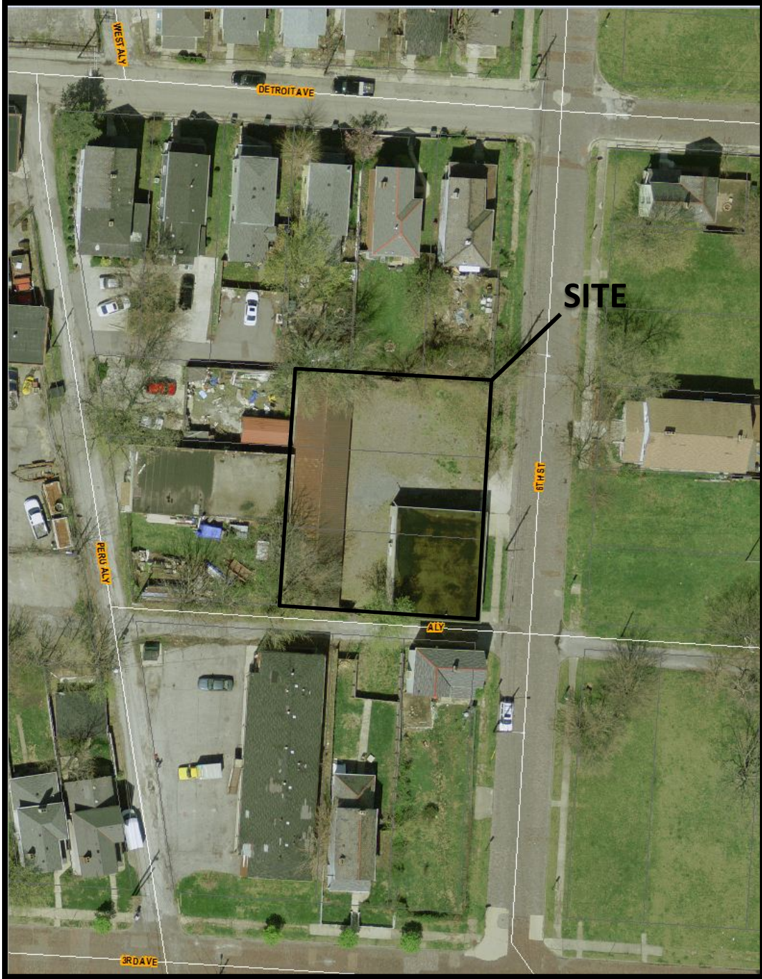
CV15-014 1023 North Sixth Street Approximately 0.02 acres