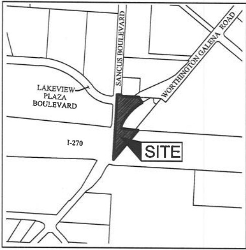
LOCATION MAP AND BACKGROUND DRAWING NOT TO SCALE