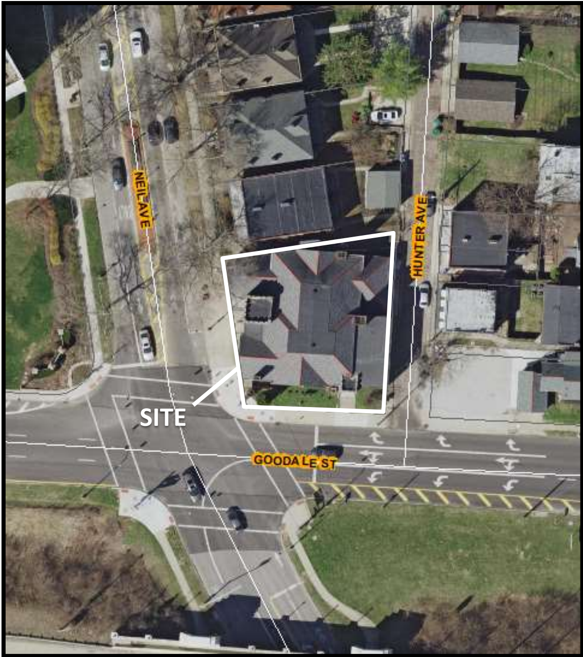
CV20-081 610 Neil Ave. Approximately 0.19 acres