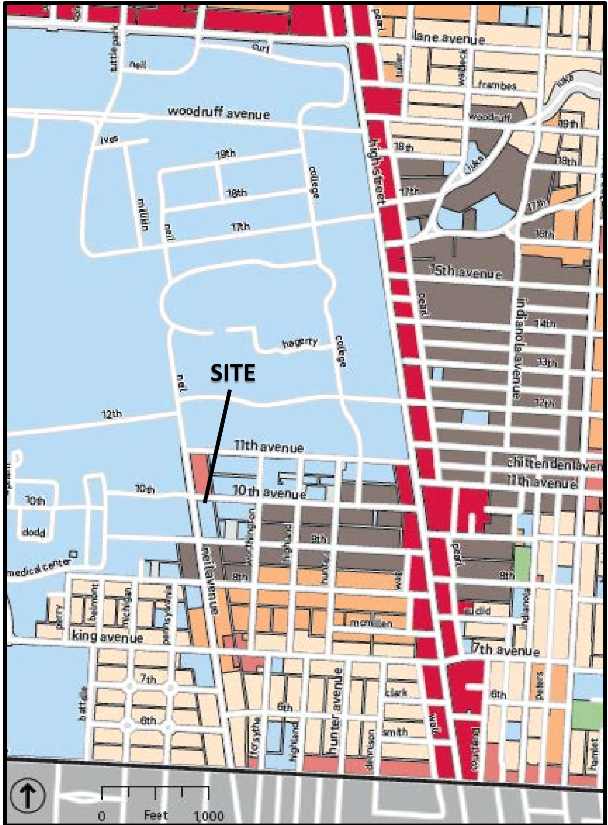
Z18-017 253 West Tenth Avenue Approximately 0.08 acres From C-4 to UCRPD